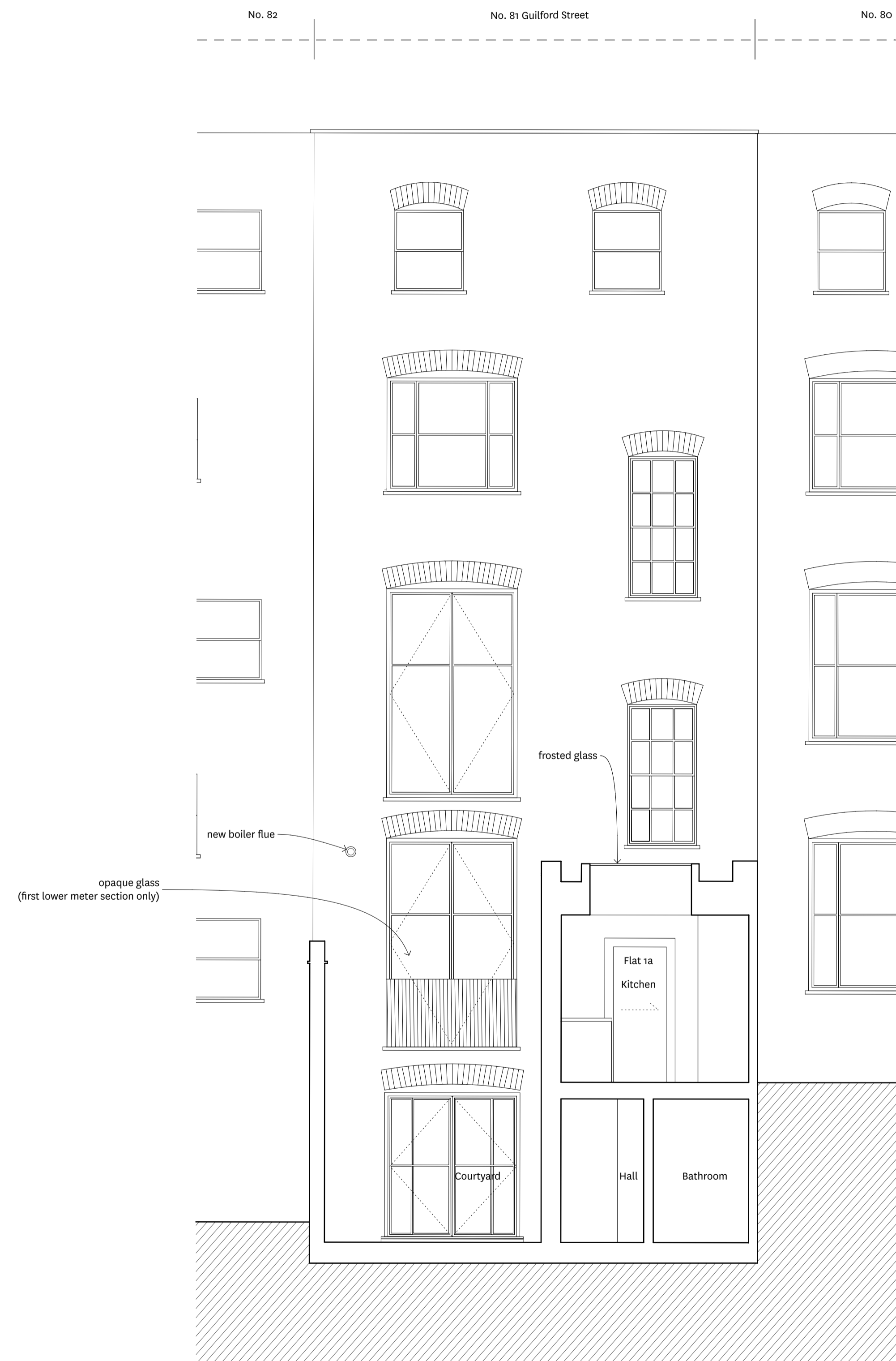
SECTION C-C - OPTION 03