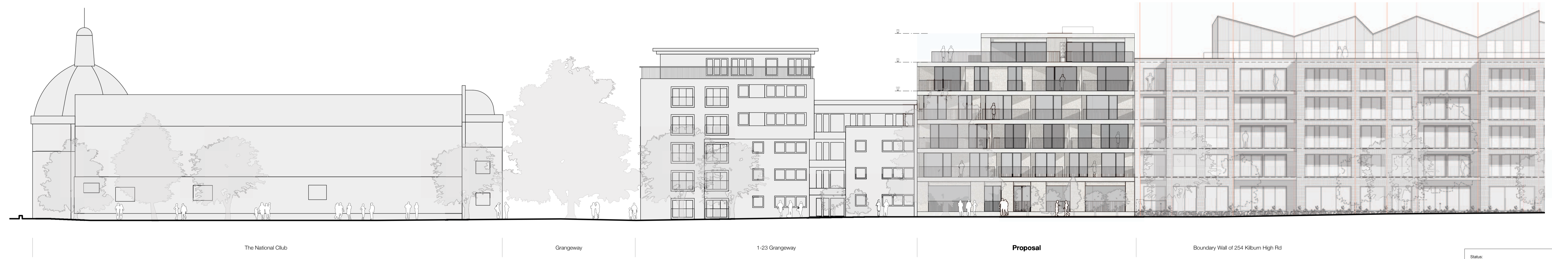
Kilburn Grange Park Elevation