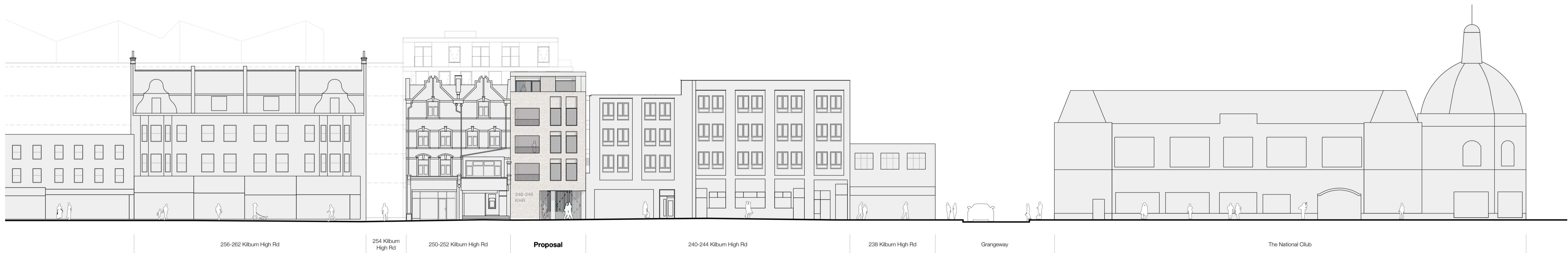
Kilburn High Rd Elevation