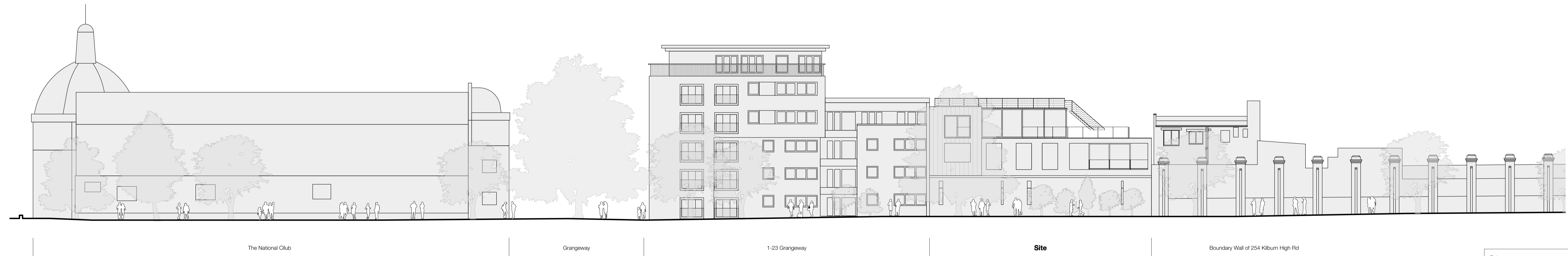
Kilburn Grange Park Elevation