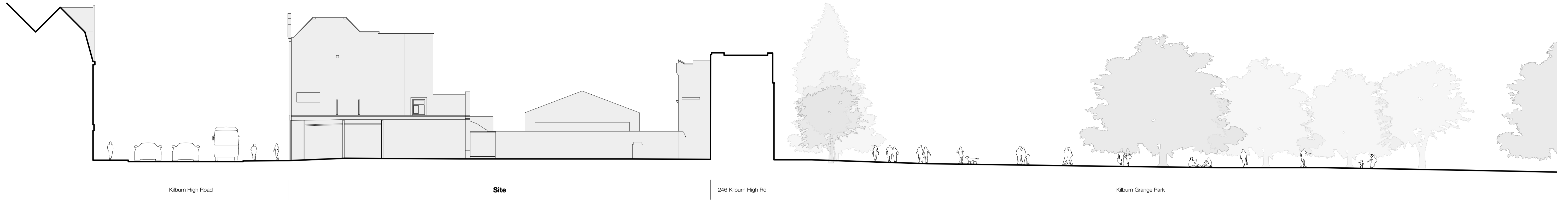
West-East Site Section