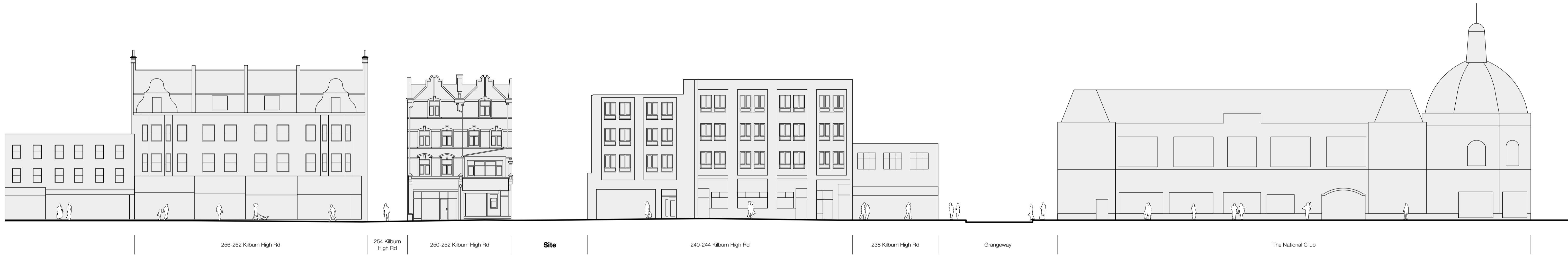
Kilburn High Rd Elevation