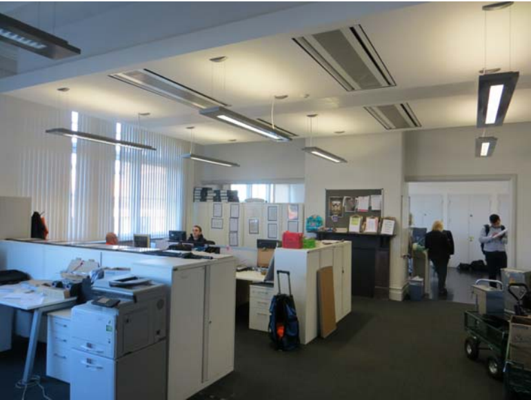
EXISTING FITTERS ROOM