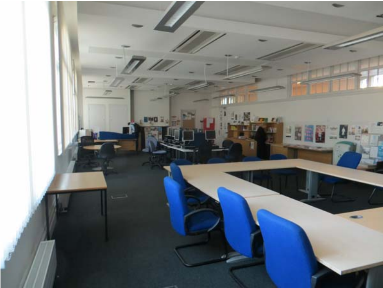
LEARNING RESOURCE CENTRE