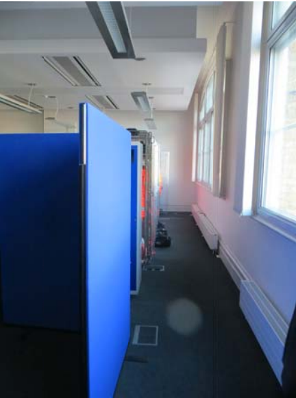
LOCKERS AND FITTING ROOM