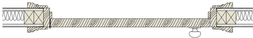
3 Section B-B 1:10@A3