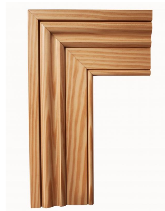
1 Typical Picture Rail Profile 1:1