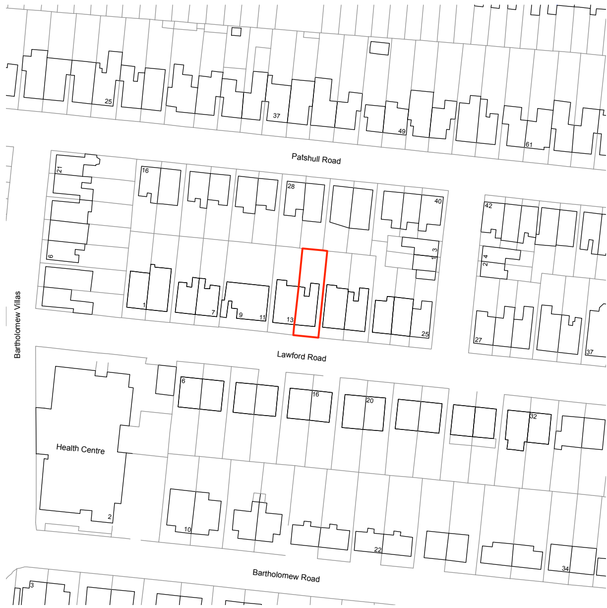
1 Location Plan 1:1250@A3