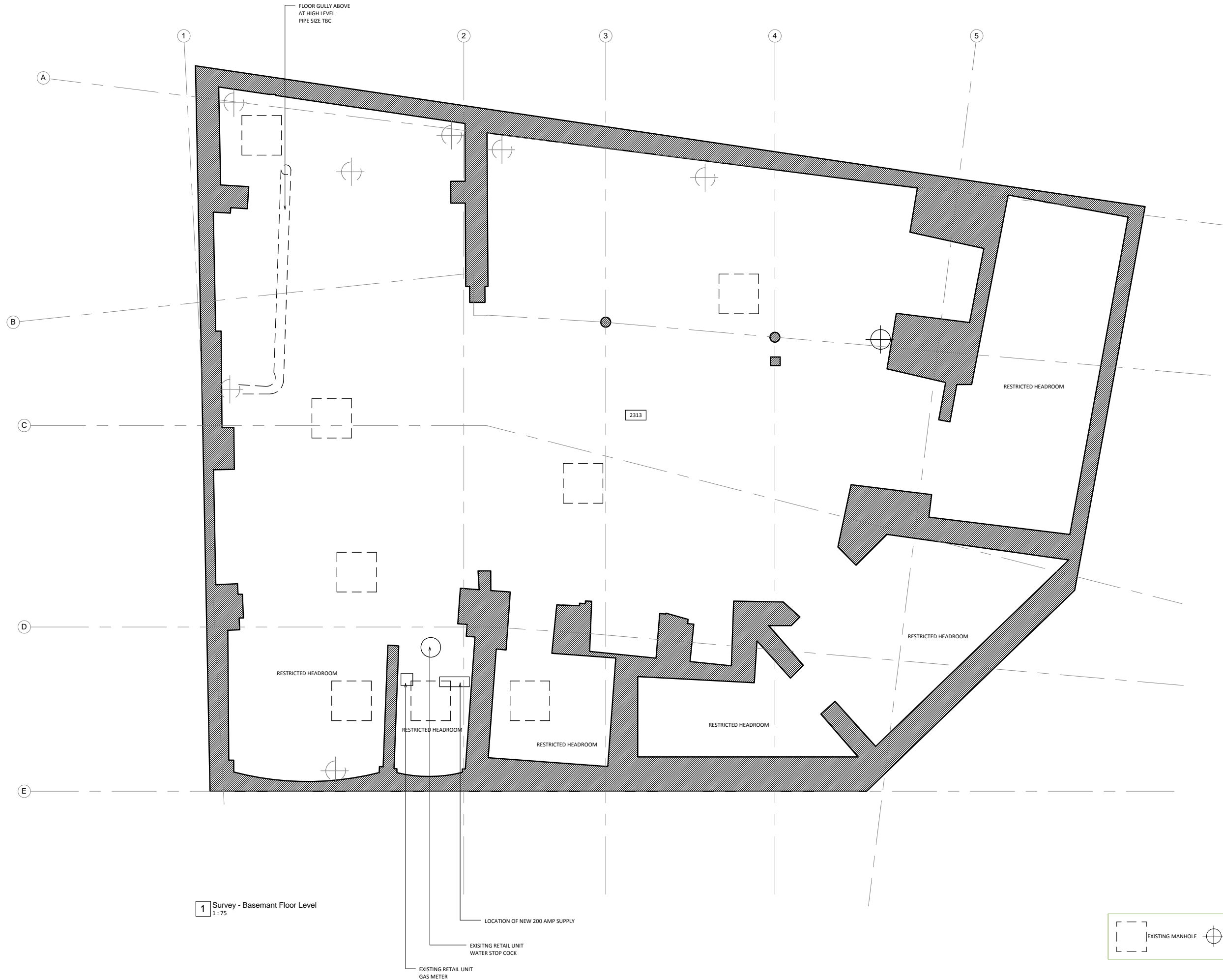
1 Survey - Basemant Floor Level 1:75

General notes: Do Not Scale from this drawing; Contractor to carry out full setting out prior to start of works and notify any discrepancies to the Architect for clarification; All works to be strictly in accordance with local authority legislations, and/or similar governing bodies; All works to be strictly in accordance with CDM Regulations (Health and Safety);