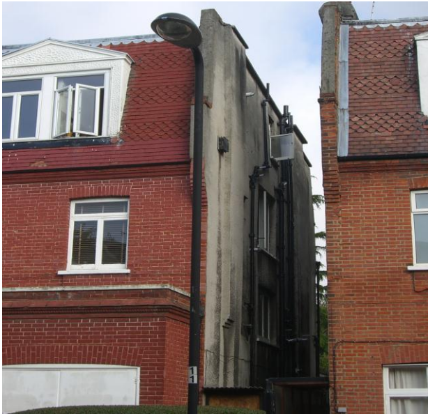
Partial Side Elevation