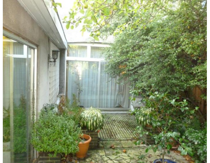
Partial Rear Elevation