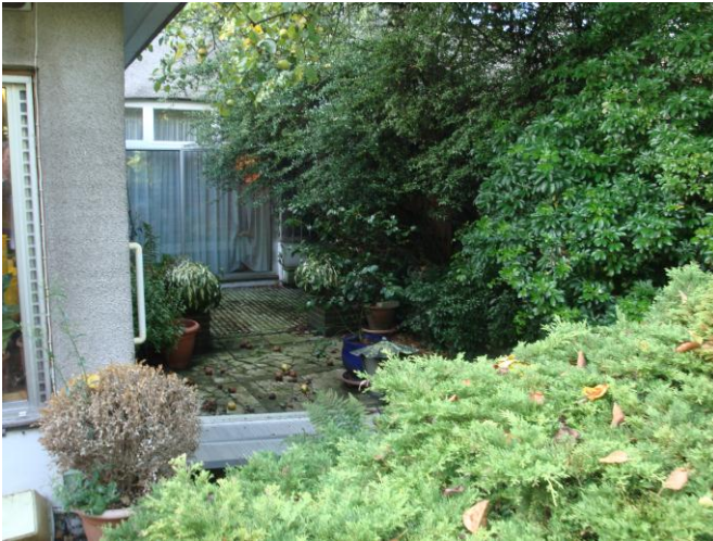
Partial Rear Elevation