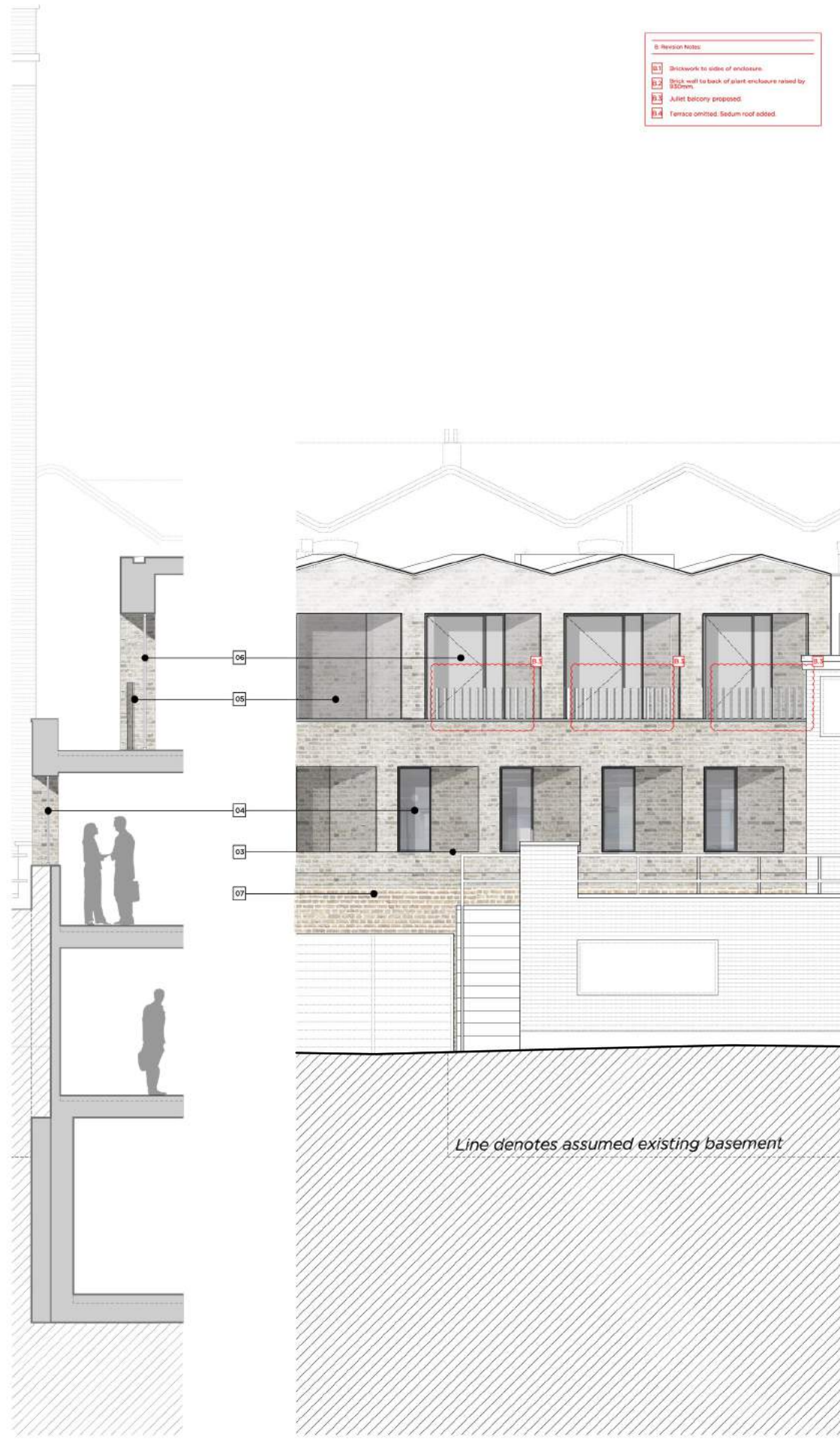
P_40 03 Section E-E 1:50