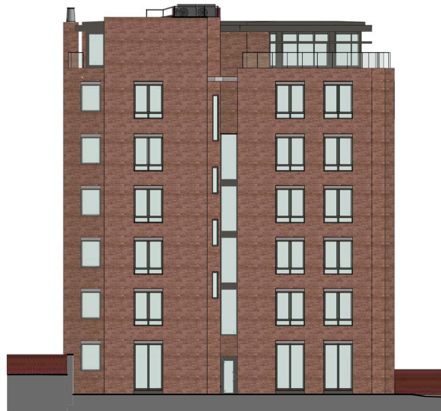
Proposed South West Elevation