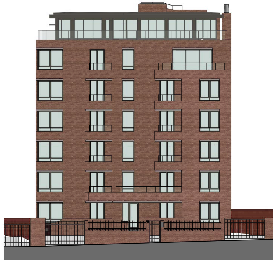
Proposed North East Elevation