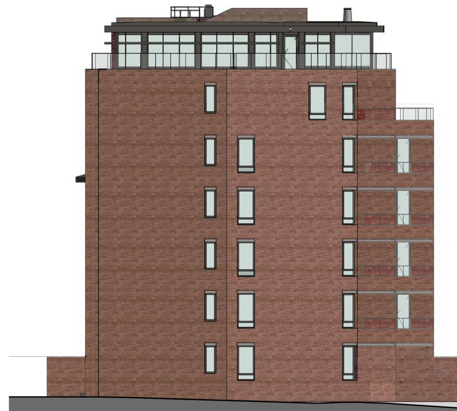
Proposed South East Elevation