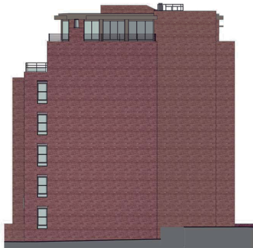
Existing North West Elevation