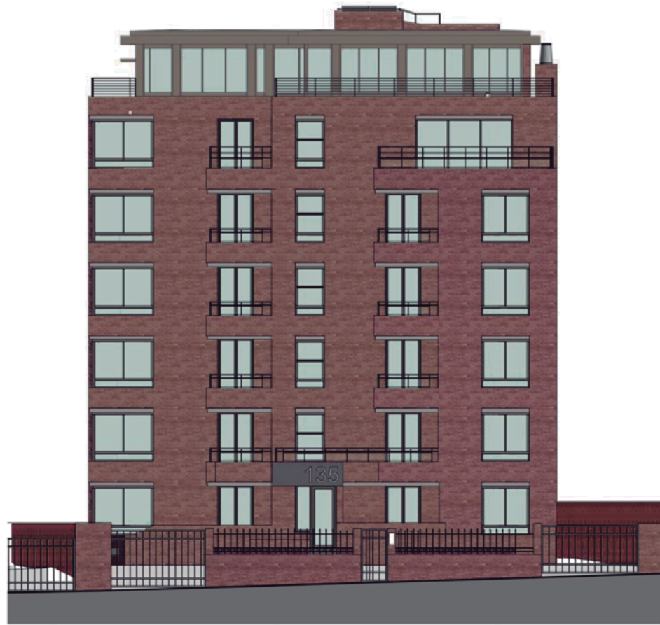
Existing North East Elevation