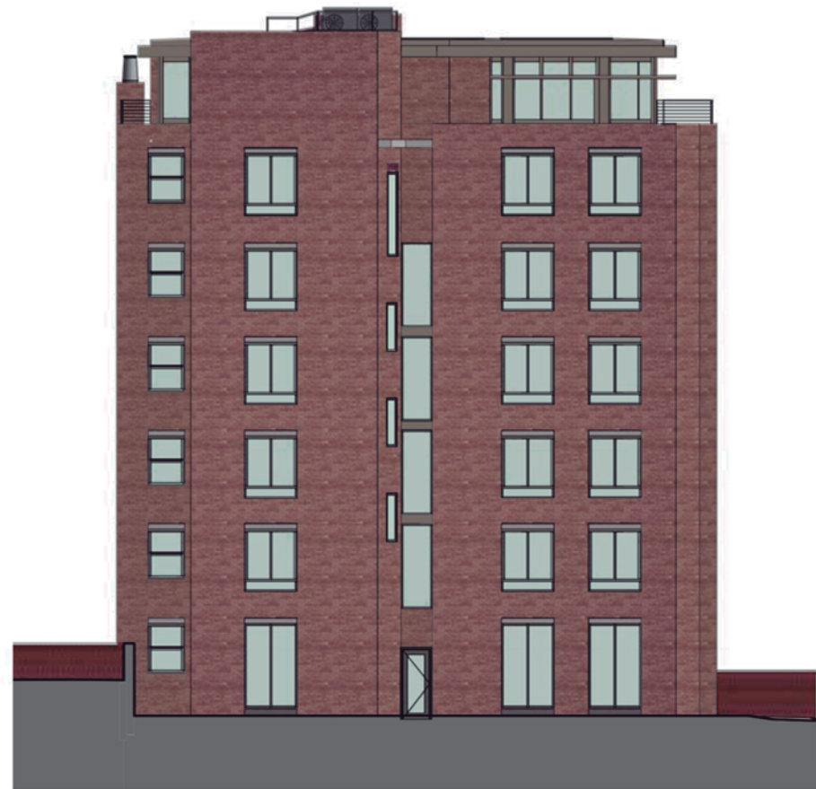
Existing South West Elevation