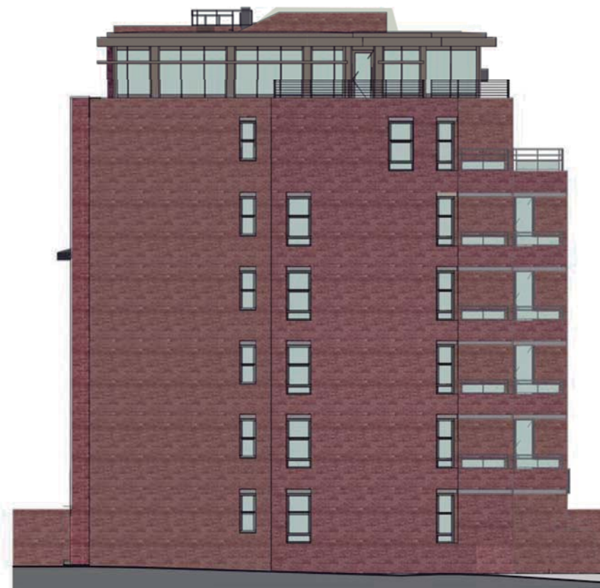
Existing South East Elevation