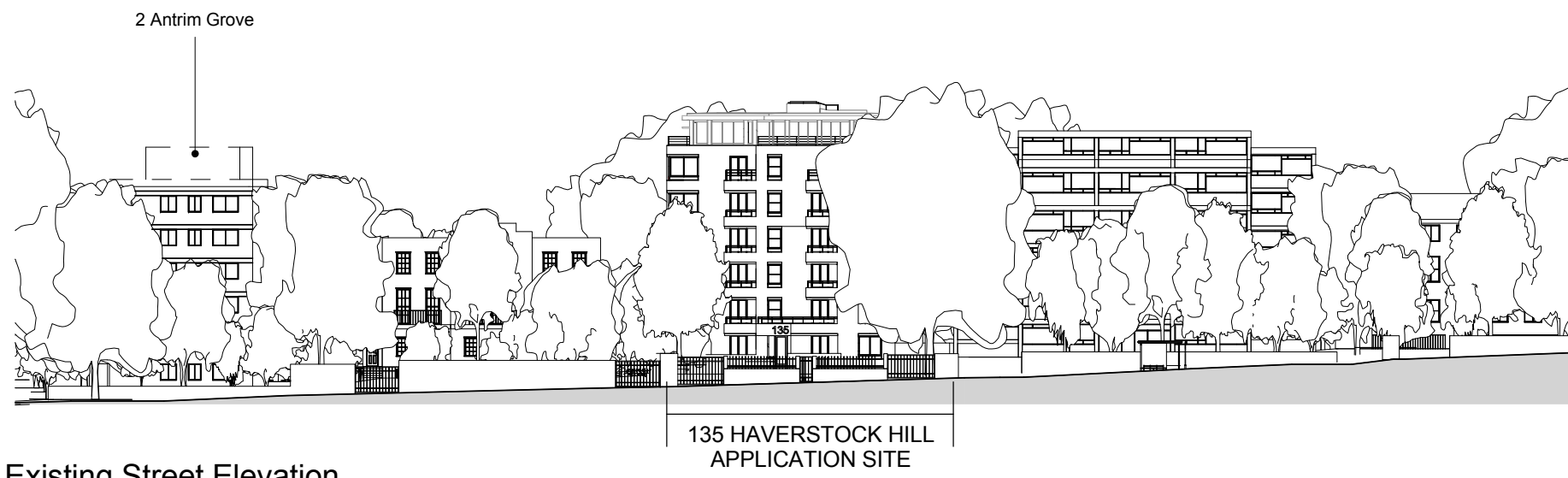
Existing Street Elevation