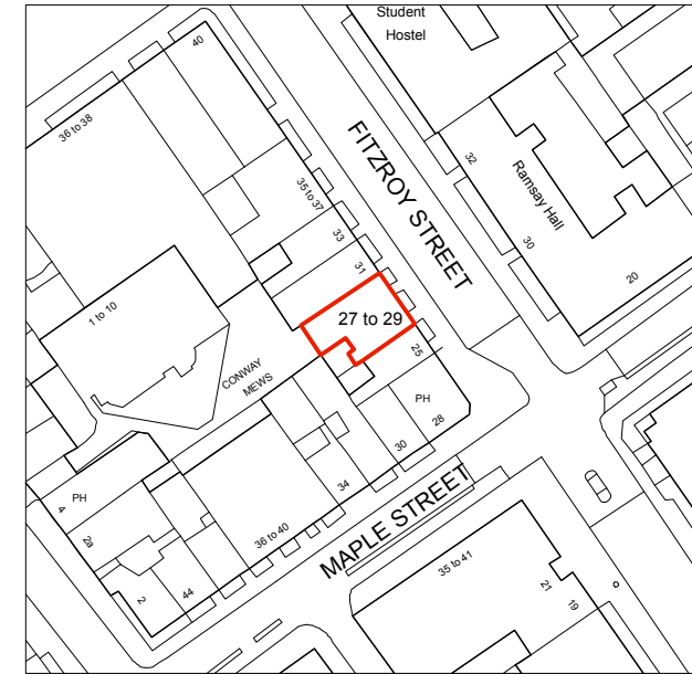
OS PLAN EXTRACT scale 1:1250 showing Site Location as within red line