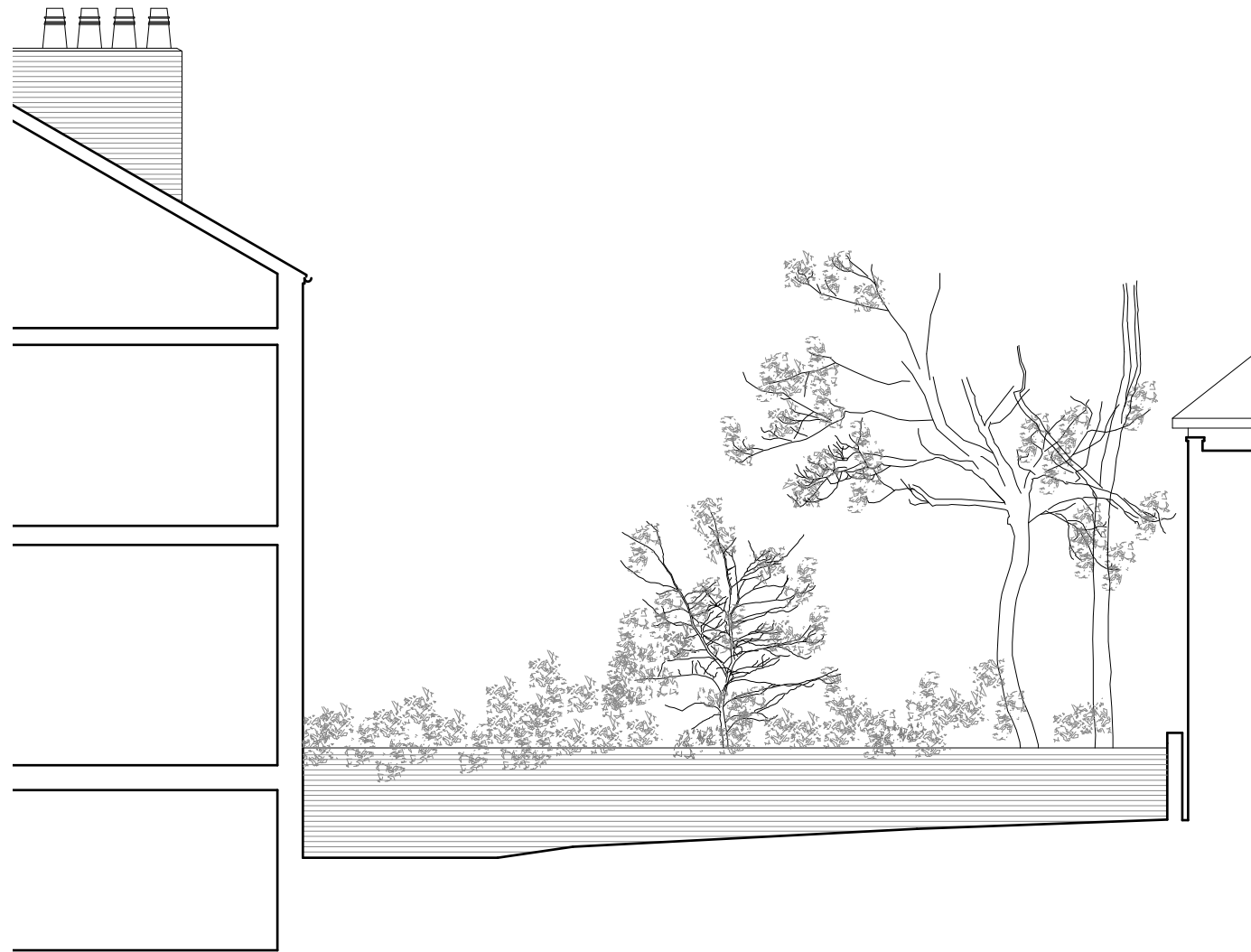
assumed ground level in rear garden of 13 Burghley Road based on garden level of No. 11