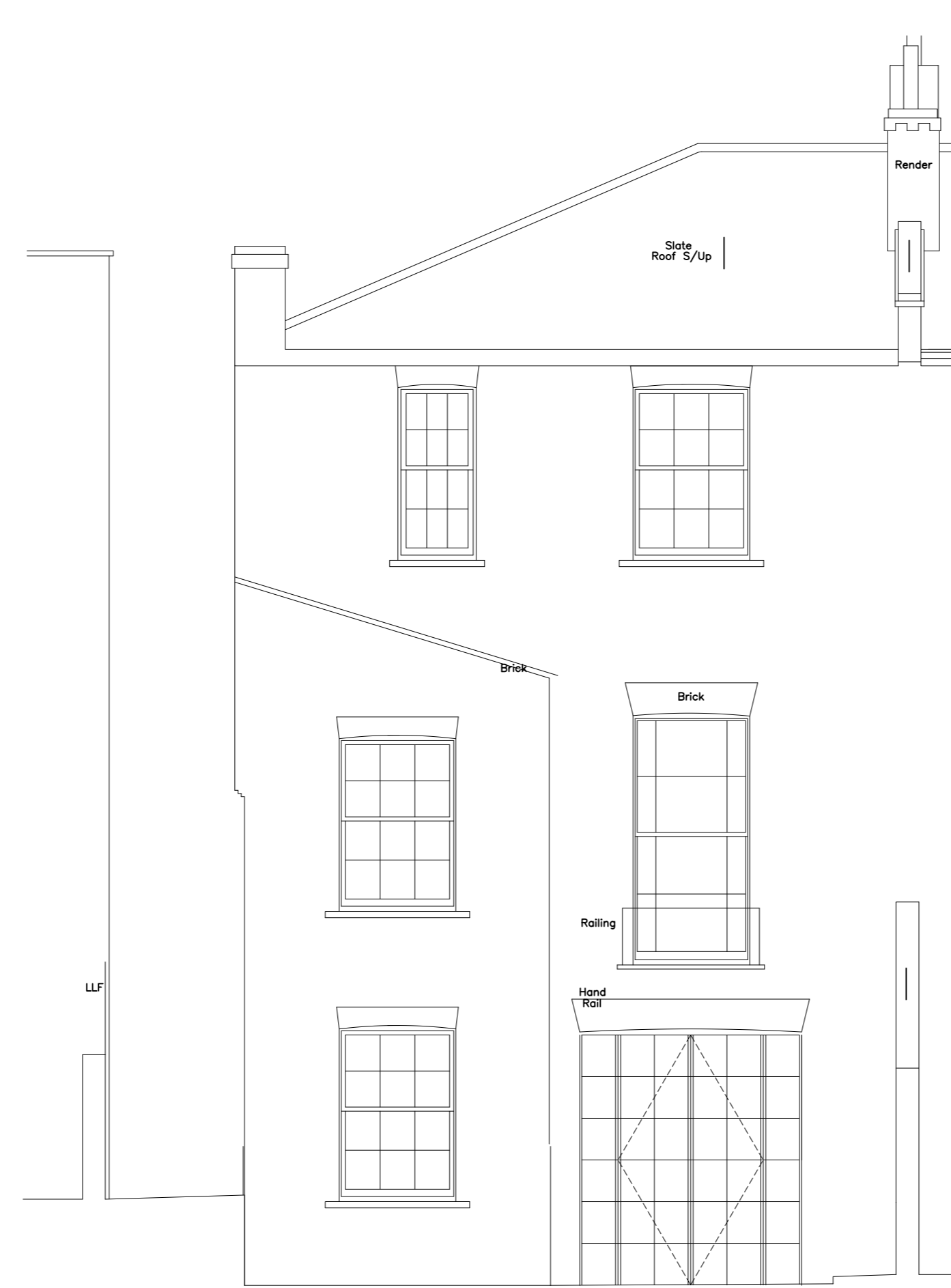
02 PROPOSED NORTH ELEVATION 1:50 @ A1 / 1:100 @ A3