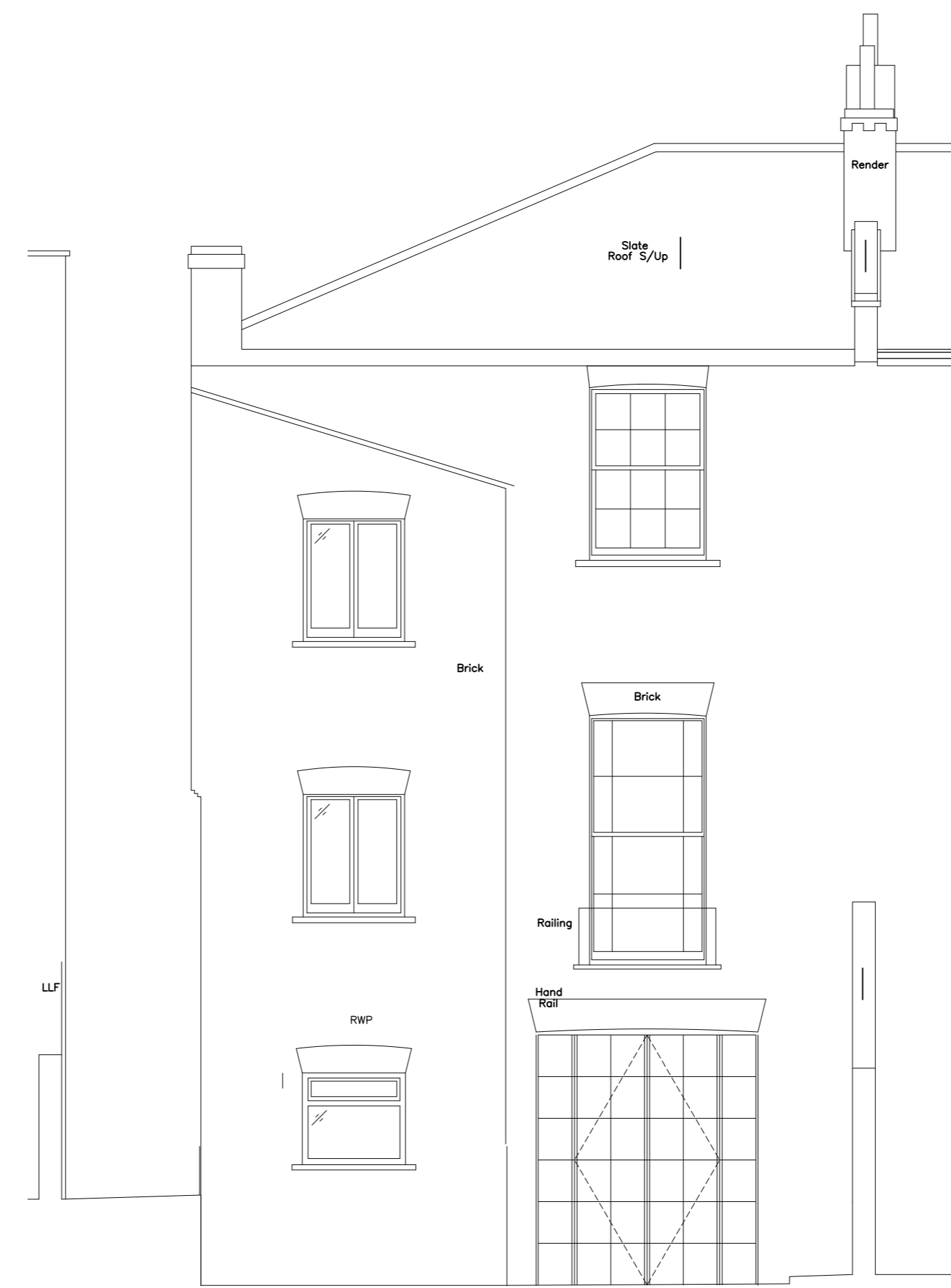
03 PROPOSED NORTH ELEVATION 1:50 @ A1 / 1:100 @ A3