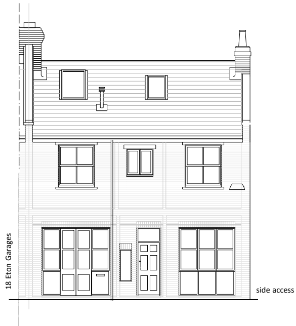
existing and proposed elevation to Eton Garages