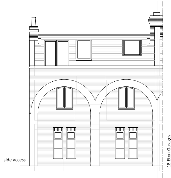
existing and proposed elevation to Lambolle Place