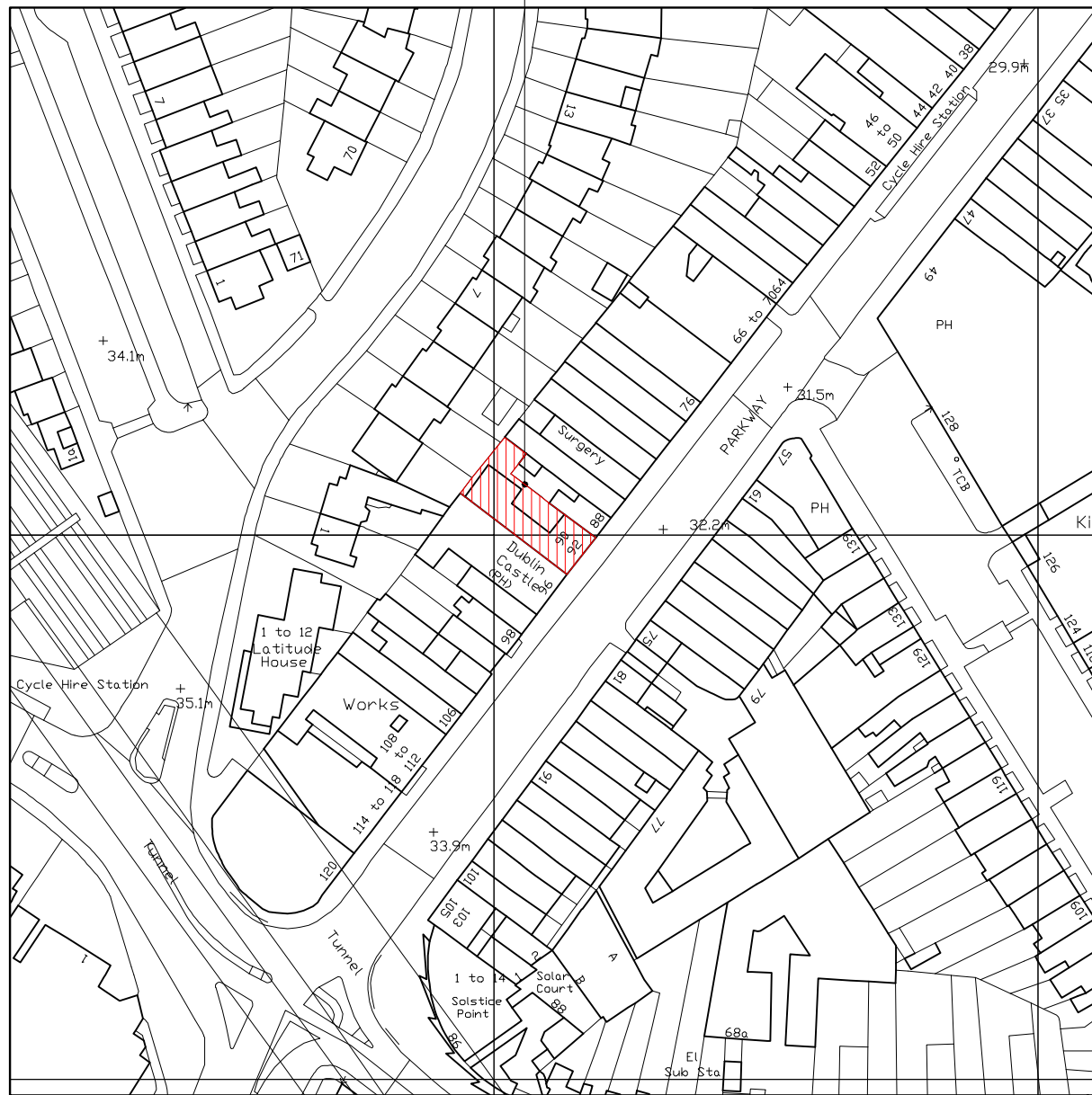
EXISTING LOCATION PLAN scale 1:1250