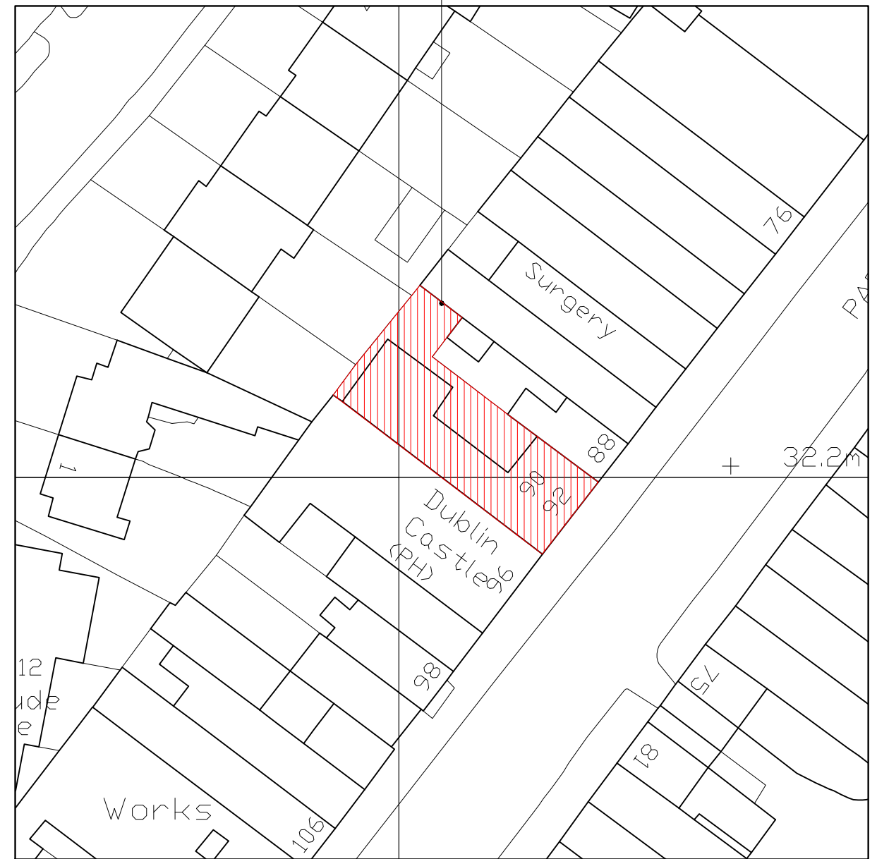
EXISTING SITE PLAN scale 1:500