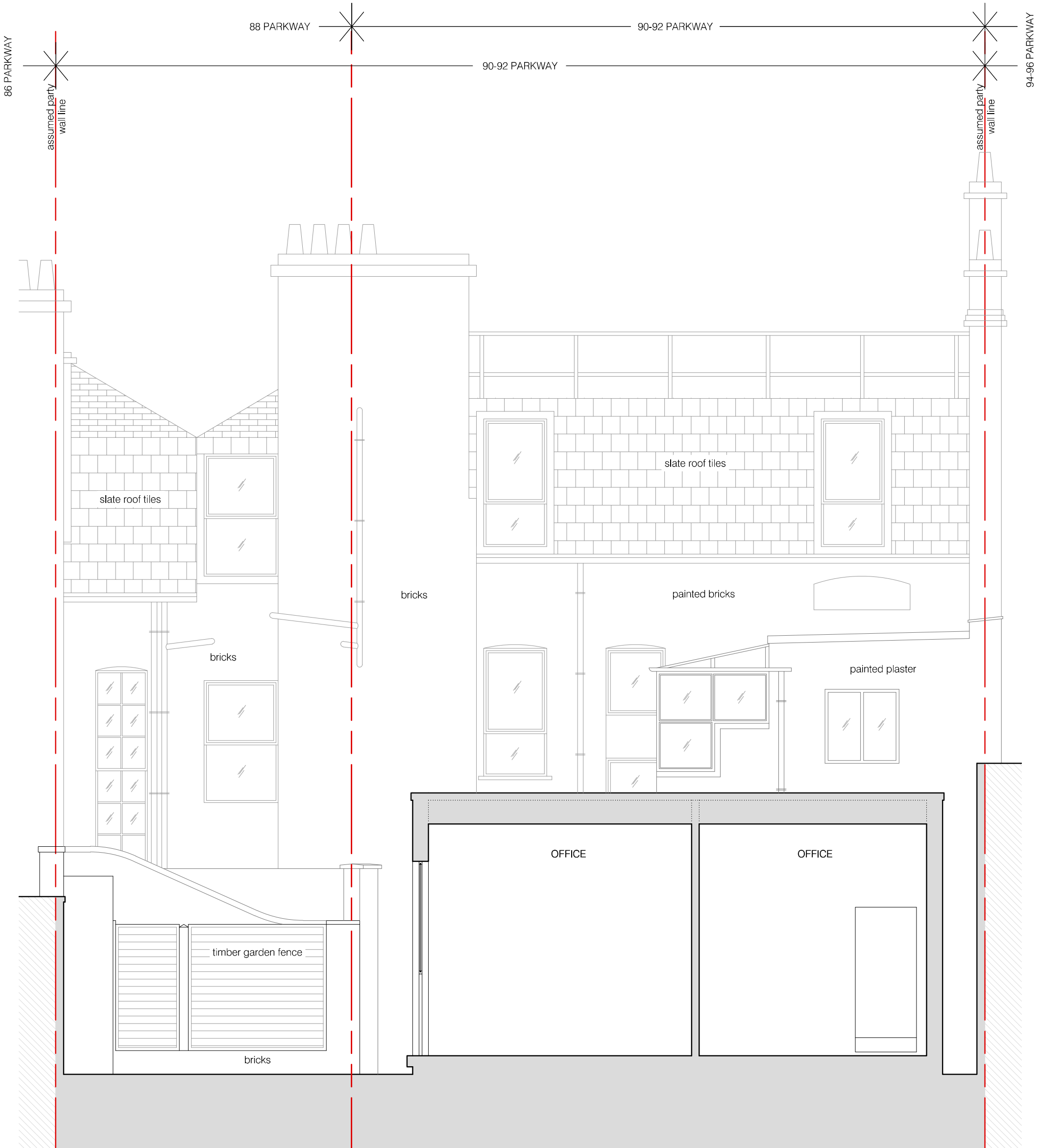
01 EXISTING SECTION-ELEVATION A-A scale 1:50

These plans are project and site specific and shall only be used for their intended purpose unless otherwise permitted by written consent of Brian O'Reilly Architects. All dimensions shown are indicative and must be double checked on site by the contractor. Any inconsistencies found must be reported to Brian O'Reilly Architects. DO NOT SCALE FROM THE DRAWINGS.