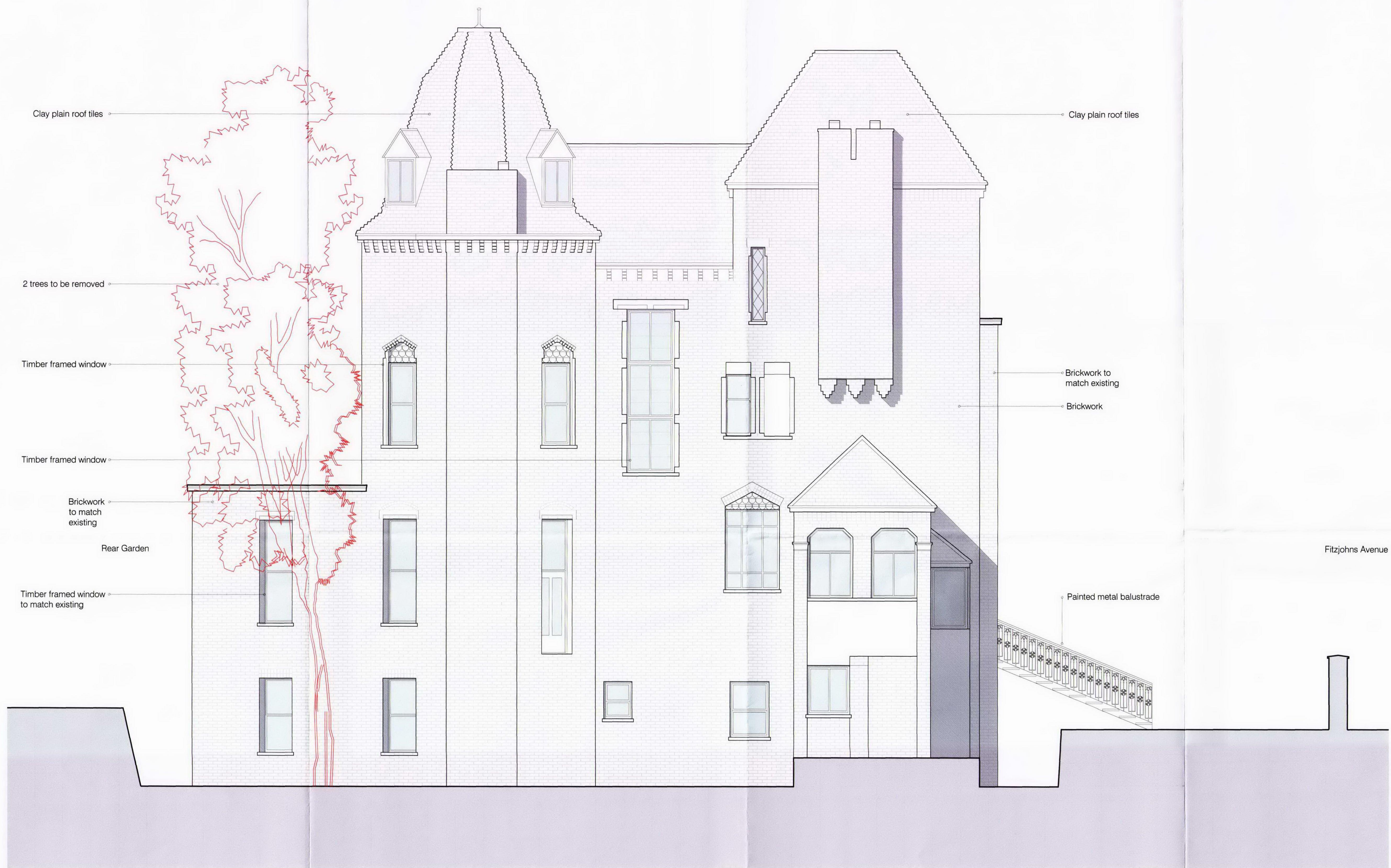
SOUTH ELEVATION (SIDE)