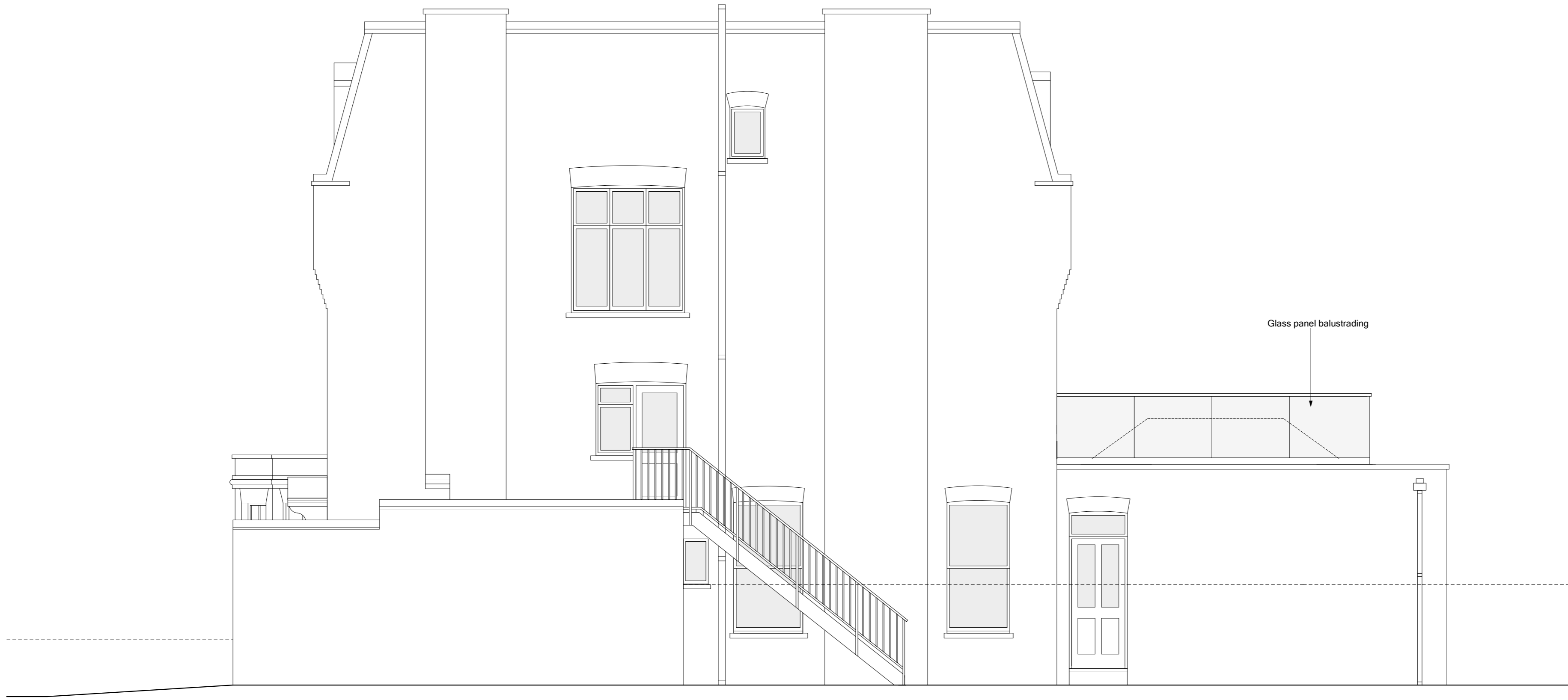
Proposed Side Elevation (pursuant to: 2016/6502/P) scale 1:50 @ A2