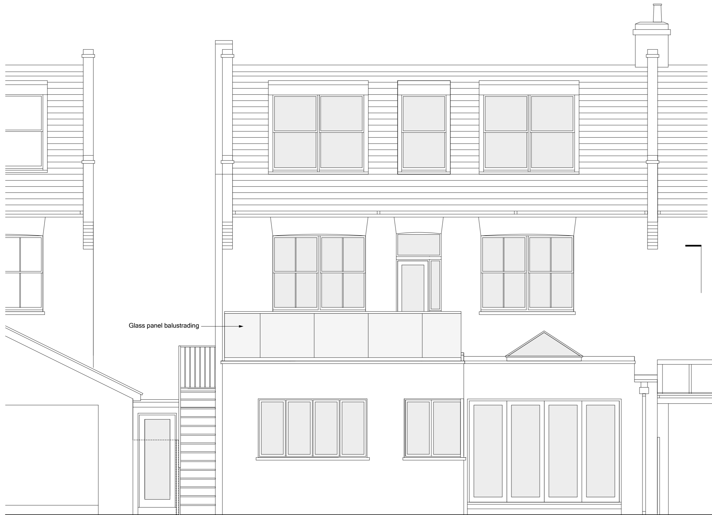
Proposed Rear Elevation (pursuant to: 2016/6502/P) scale 1:50 @ A2