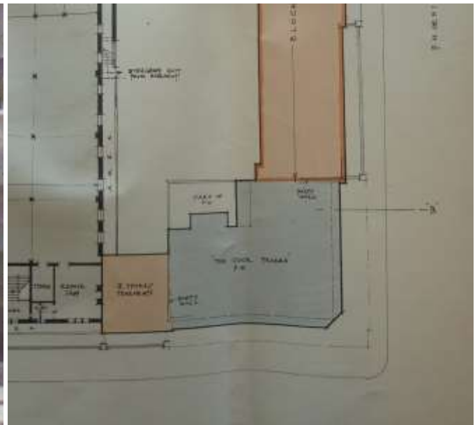
Figure 15: The Cock Tavern Plan, 1928