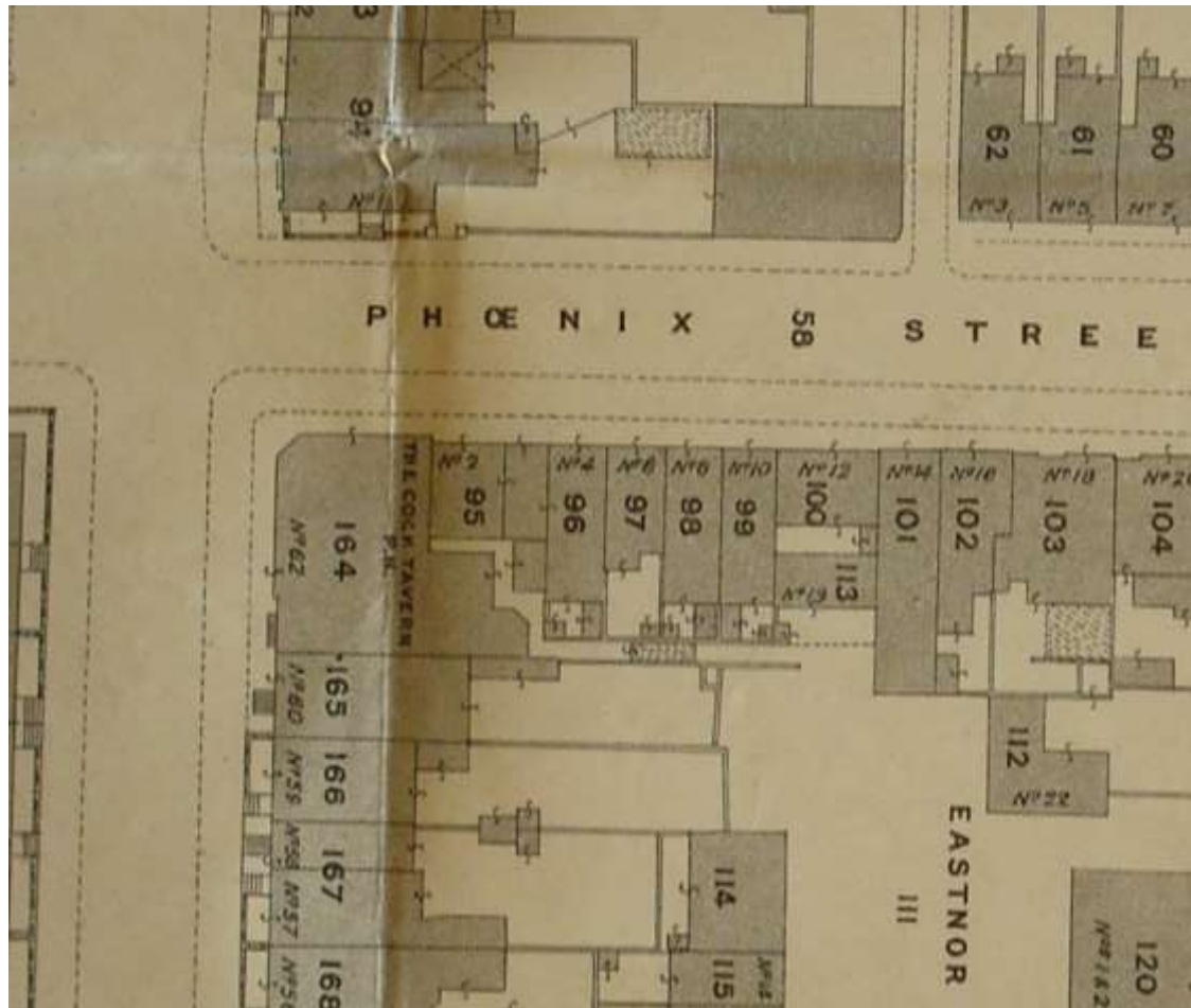
Figure 6: The Cock Tavern, Building Act Clearance Plan, 1929