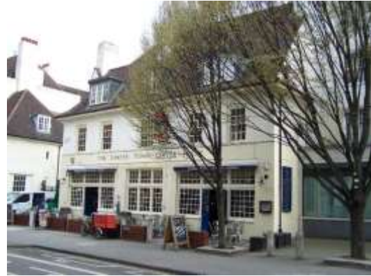
Figure 13: Somers Town Coffee House