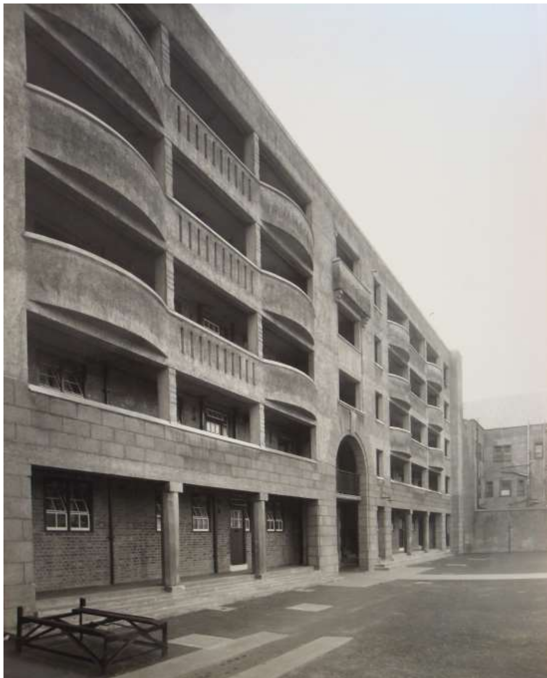
Figure 11: Walker House, Southern Block/Courtyard Elevation, 1929