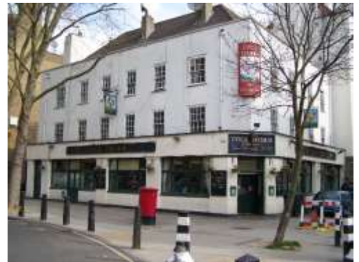
The Cock Tavern, Phoenix Road