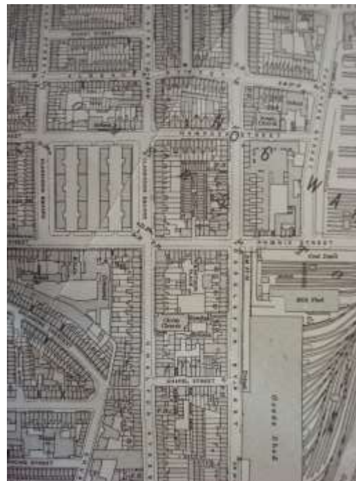
Figure 5: Third Edition OS, 1913