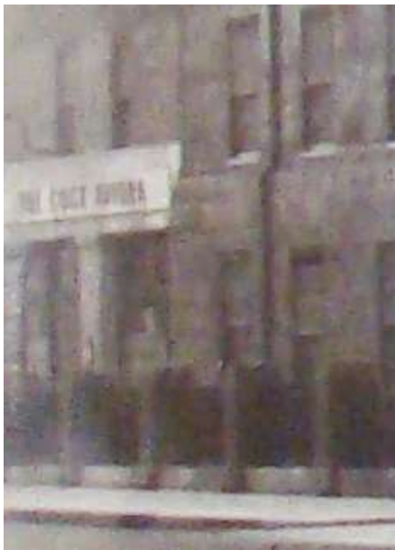
Figure 14: Historic Signage