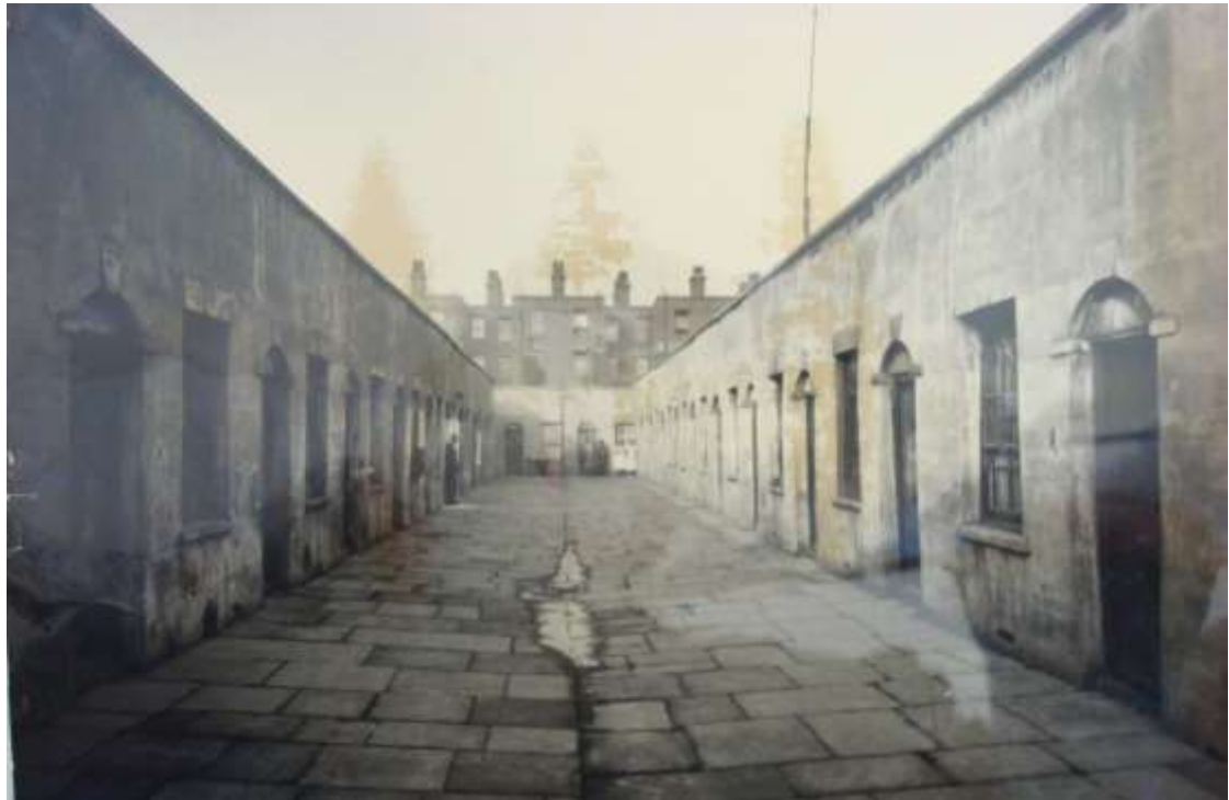
Figure 7: Equity Buildings, Looking North, 1928