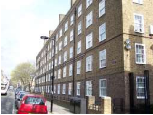
Figure 12: Walker House, North Block