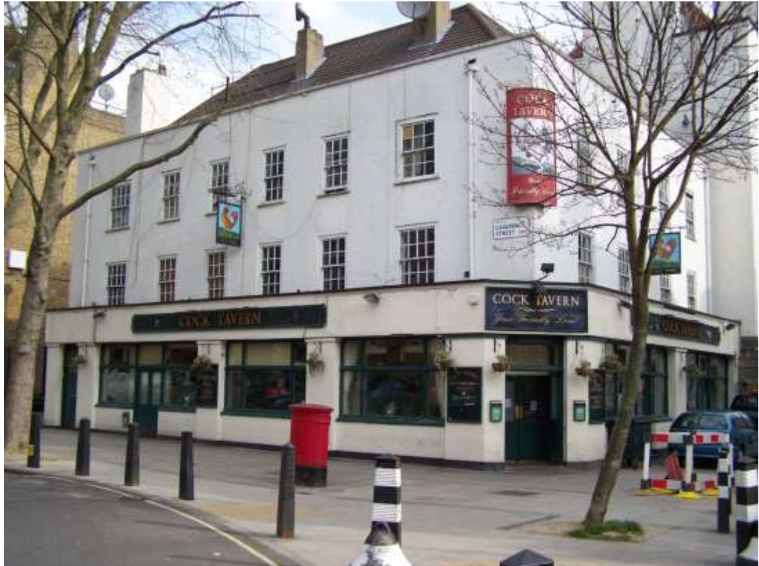
Figure 1: The Cock Tavern