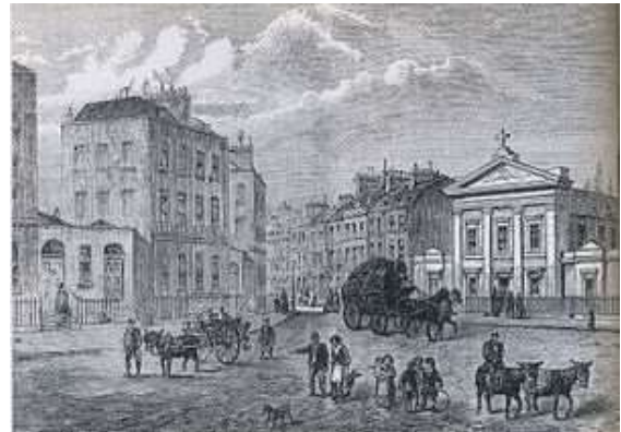
Figure 3: Clarendon Square in 1850, Polygon to Left