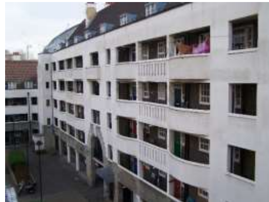
Figure 8: Walker House & The Cock