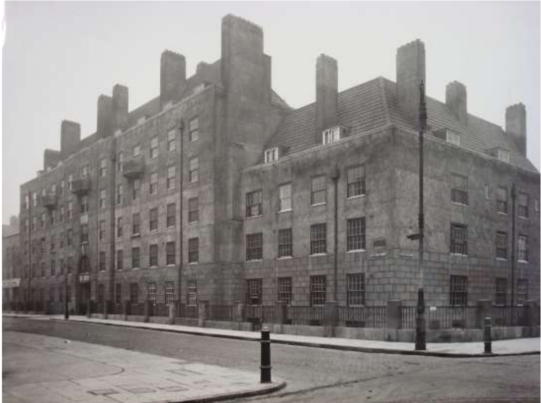
Figure 10: Walker House, Southern Block/Phoenix Street Elevation, 1929

'Public House: 3 storeys and cellars. 4 windows and 6-window return to Chalton Street. Similar style. Public house frontage of transom and mullion windows with plate glass between pillars; main entrance on chamfered ground floor angle'.