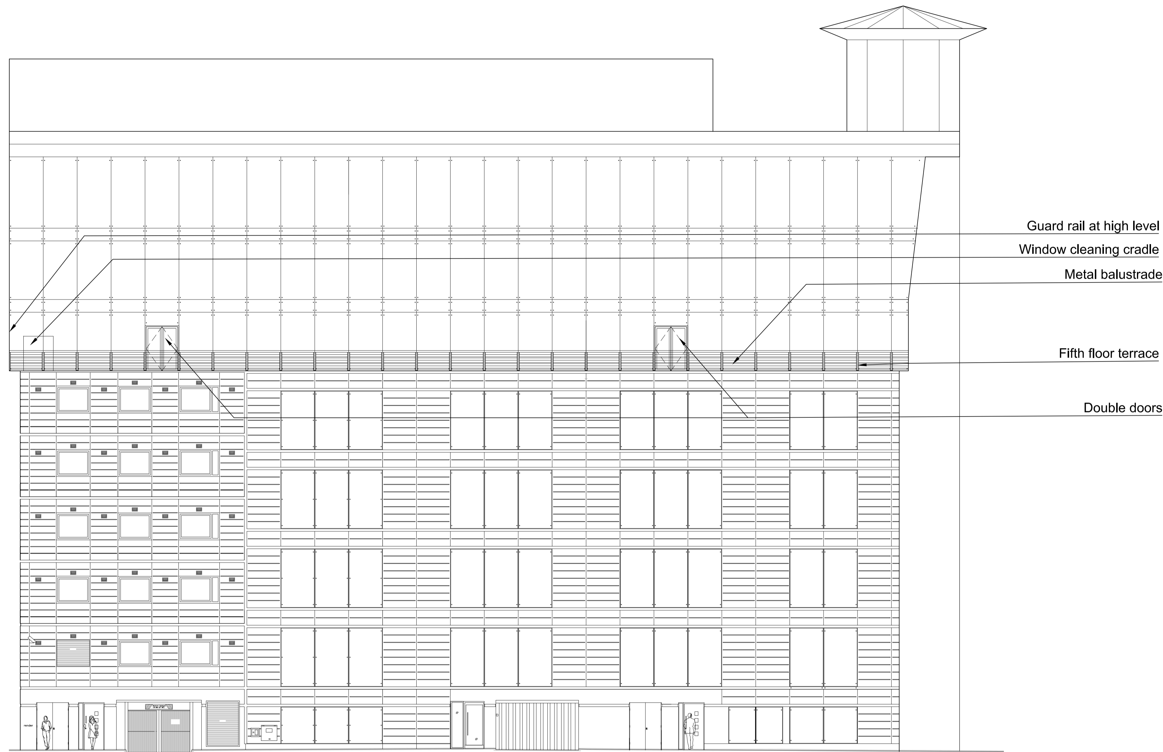
01 Existing New Compton Street Elevation Scale 1:100