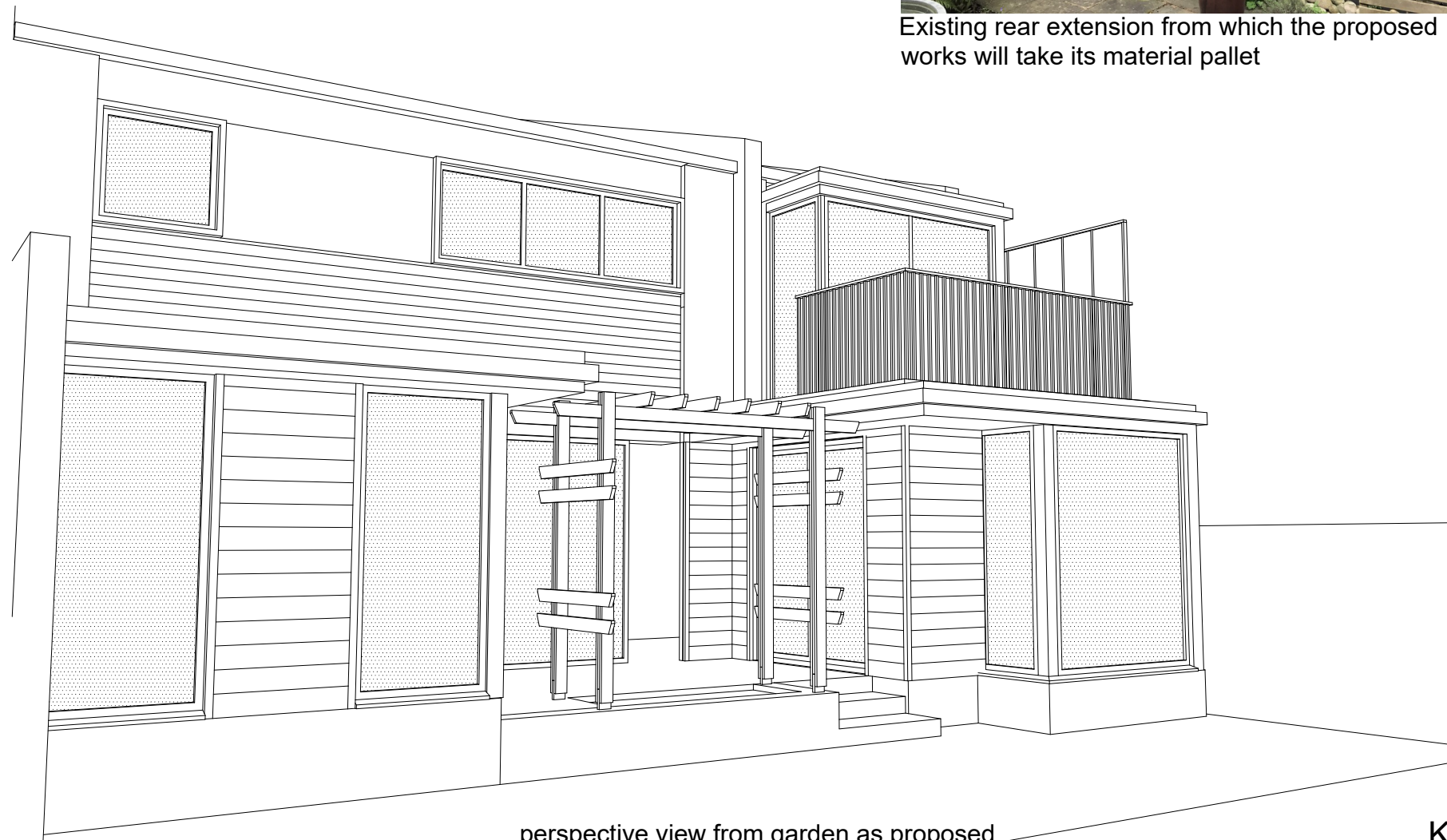
perspective view from garden as proposed