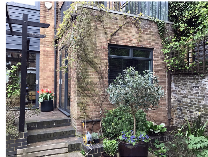
Existing rear extension to which work is proposed