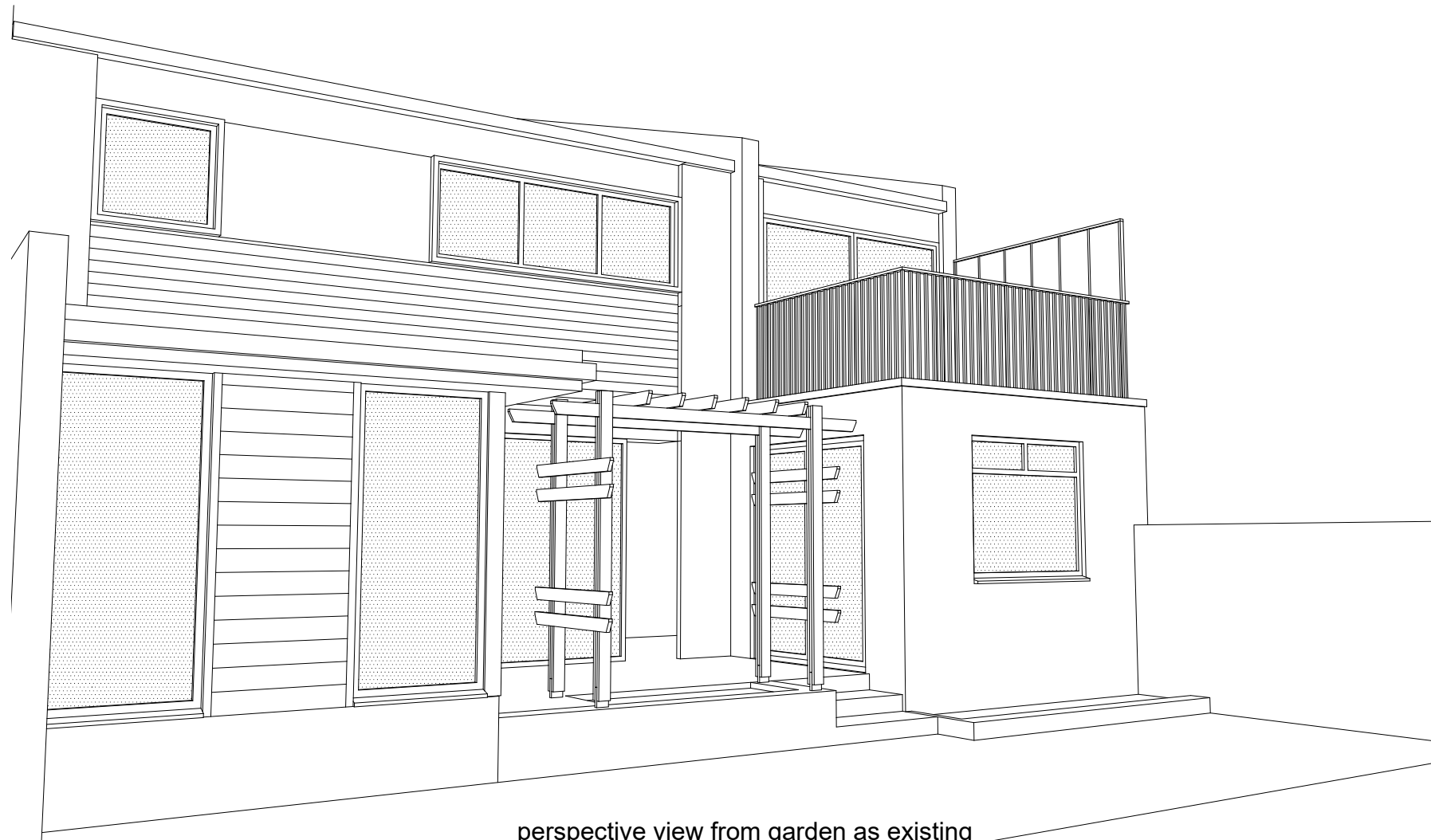
perspective view from garden as existing