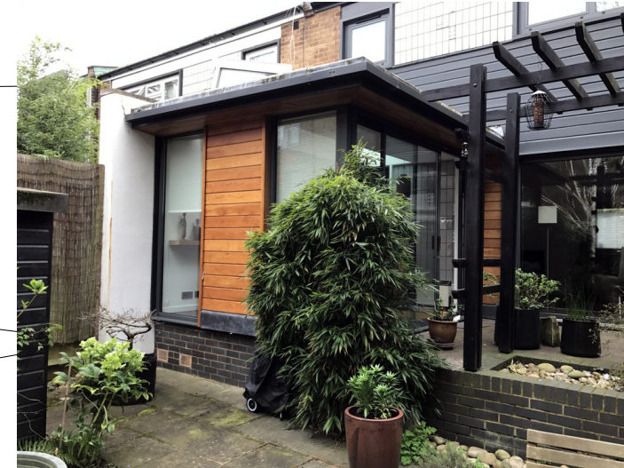
Existing rear extension from which the proposed works will take its material pallet