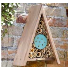
Elegance insect habitat