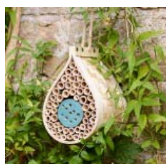
Dewdrop Bee and Bug Biome