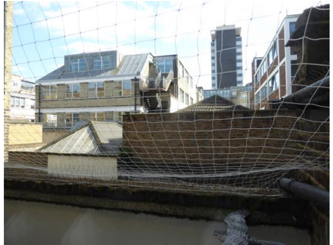
③ PHOTOGRAPH OF SOUTH ELEVATION