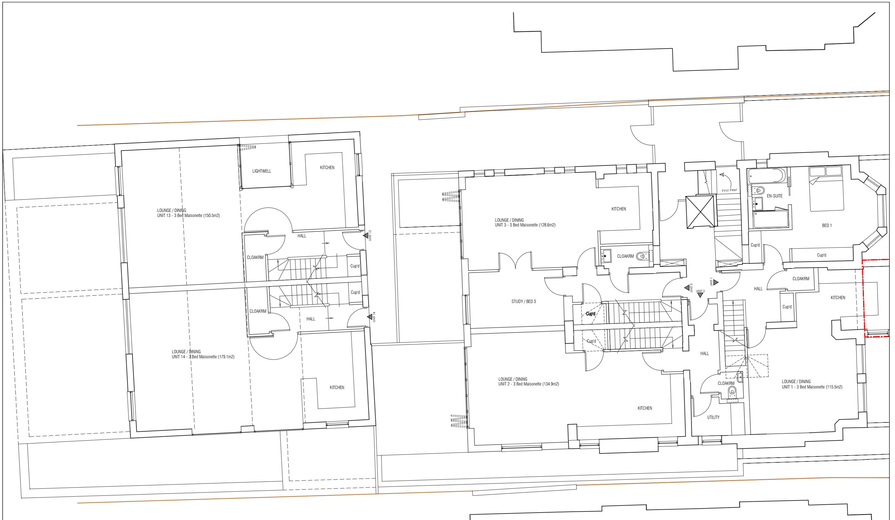
1 PROPOSED GROUND FLOOR PLAN 1 : 100