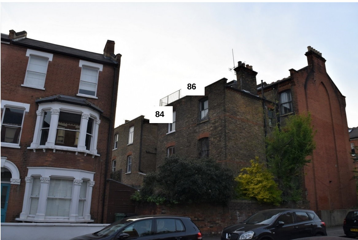
Rear view of 82, 84, 86 and 88 from Mackeson Road (Cont.)