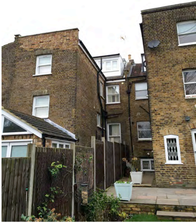
Rear garden looking at 55 Achilles Road