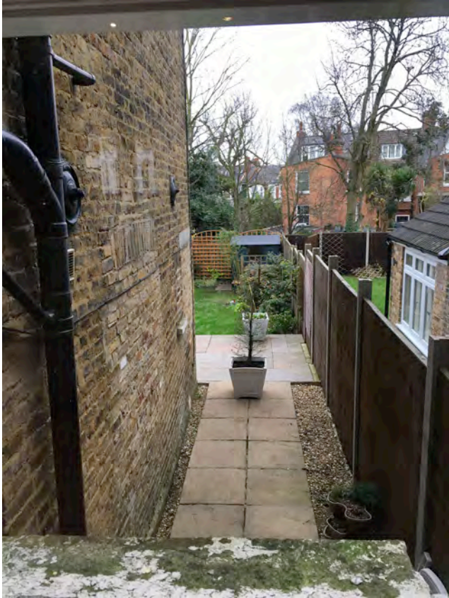
View of garden from kitchen