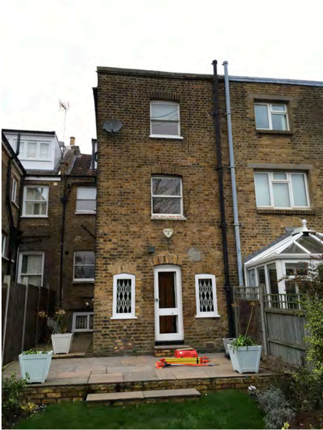
Rear garden looking at 53 and 51 Achilles Road