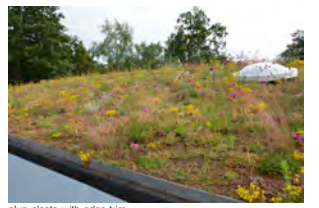
plug plants with edge trim