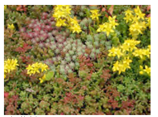
sedum blanket