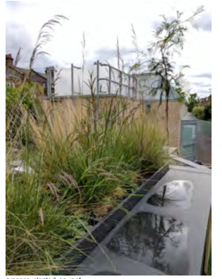
grasses planted on roof

sedum roof with plug planting for biodiversity. 80-100mm substrate with irrigation. low maintenance. shady area. 4 sedum species to blanket area with 8 perennial and 3 native plants species intermixed. (see submitted Bauder vegetation guide)