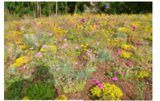
plug plants with no sedum blanket