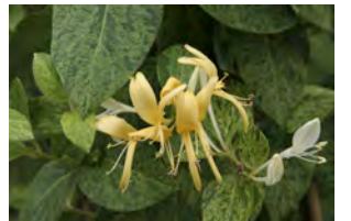
Japanese honeysuckle