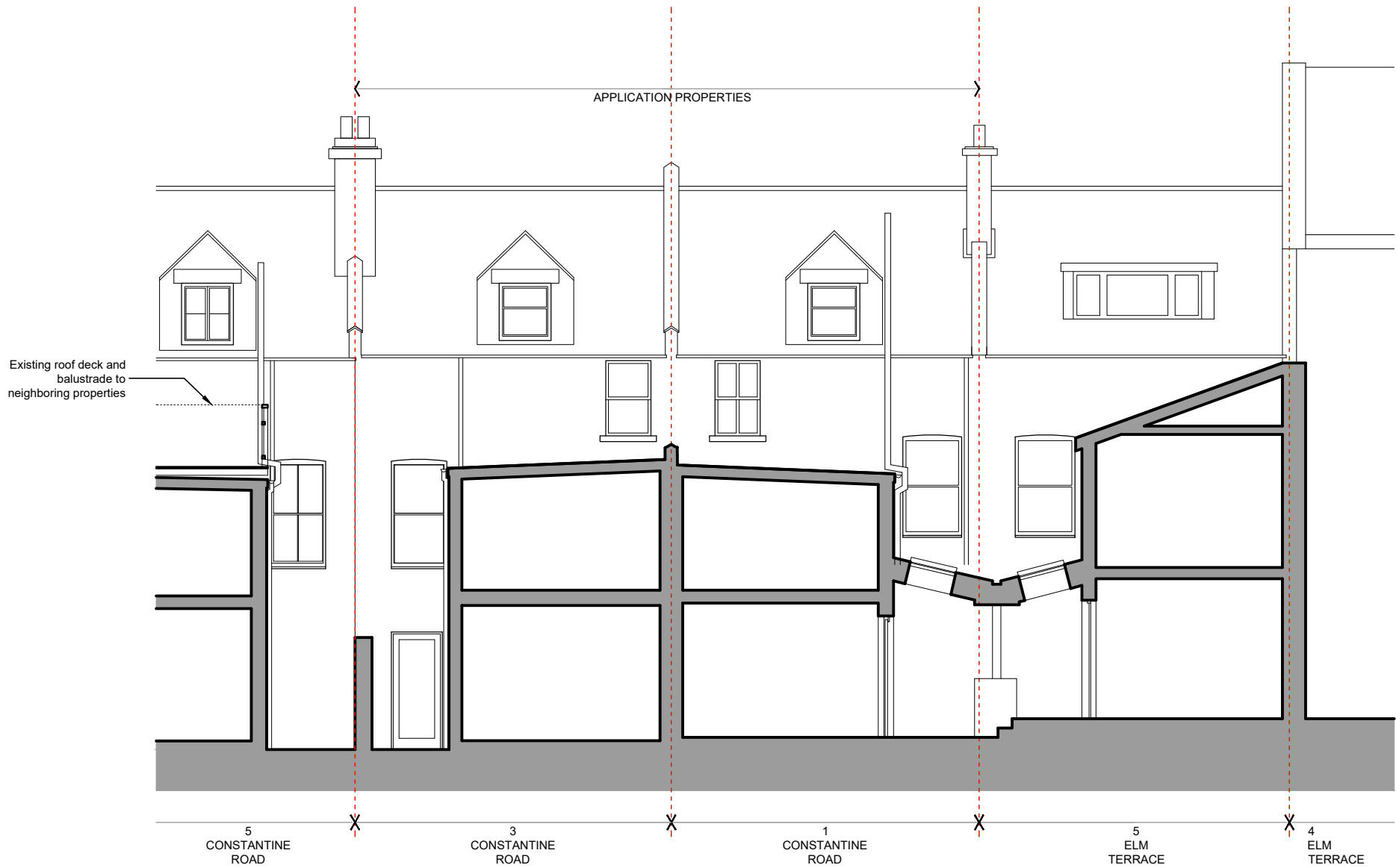
EXISTING REAR SECTION B-B 1 & 3 Constantine Road

NOTE THIS DRAWING IS TO BE READ IN CONJUNCTION WITH ALL OTHER RELEVANT DRAWINGS AND SPECIFICATIONS THIS DRAWING HAS BEEN PREPARED FOR IDENTIFICATION PURPOSES ONLY. VERIFICATION OF DRAWN INFORMATION TO BE CARRIED OUT BY CONTRACTOR PRIOR TO OTHER USE. ALL DIMENSIONS TO BE CHECKED ON SITE, AND SUCH DIMENSIONS TO BE THE CONTRACTORS RESPONSIBILITY. DRAWING ERRORS AND OMISSIONS TO BE REPORTED TO THE CONTRACT ADMINISTRATOR.