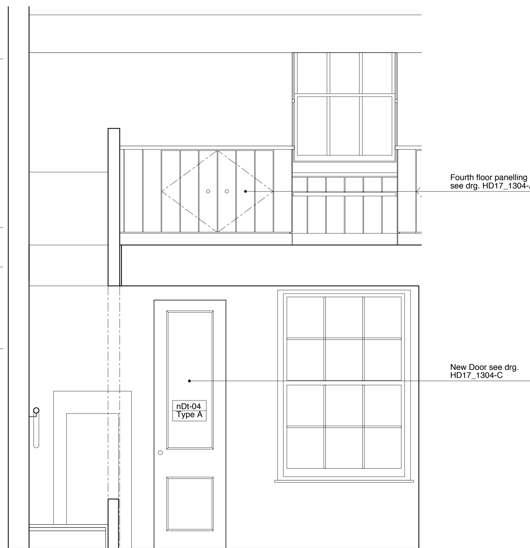
C Elevation C 1:20