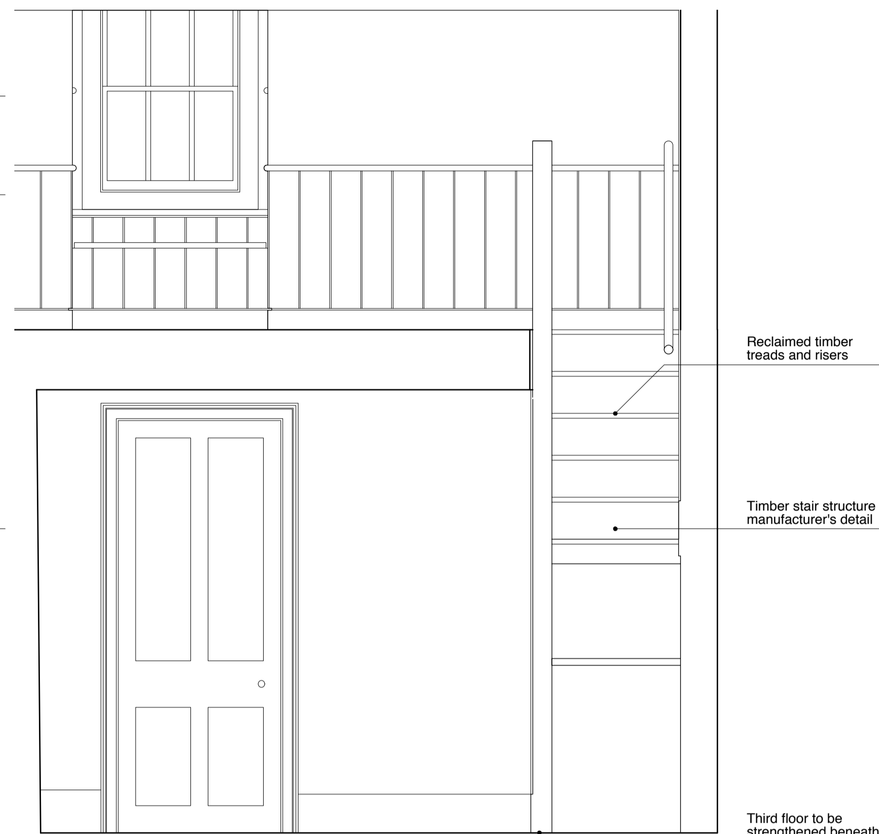
B Elevation B 1:20