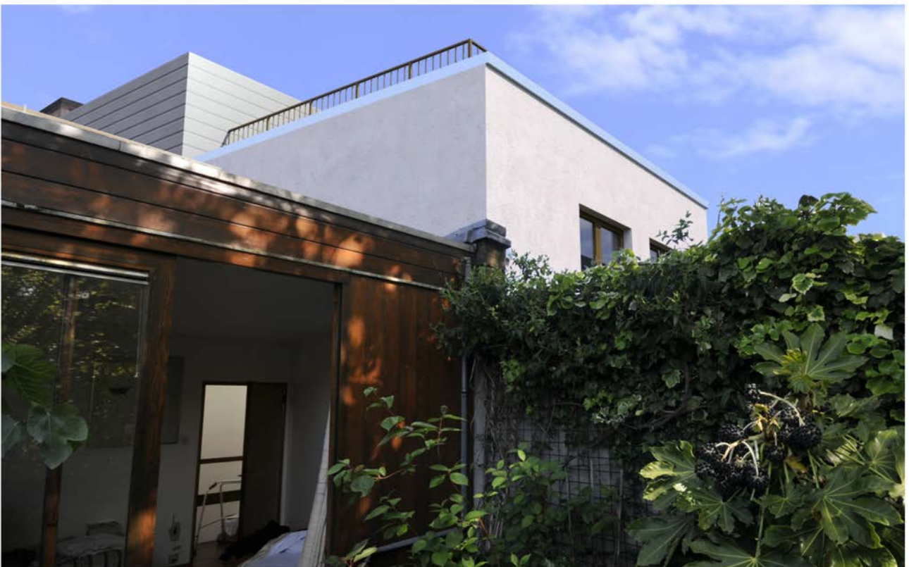
View2-View from 1 Colville Place Terrace Garden: PROPOSED