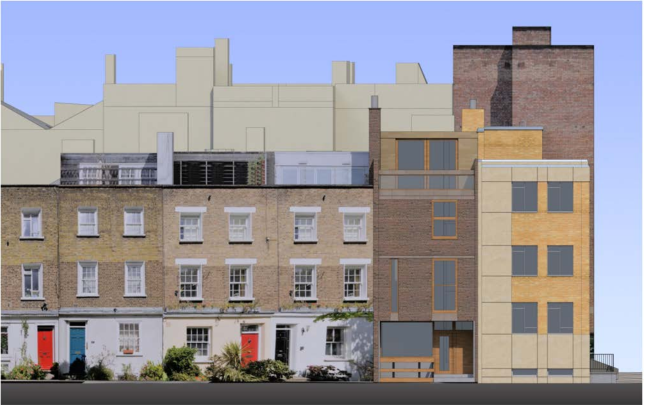
View 1 - Elevation from Whitfield Street: EXISTING