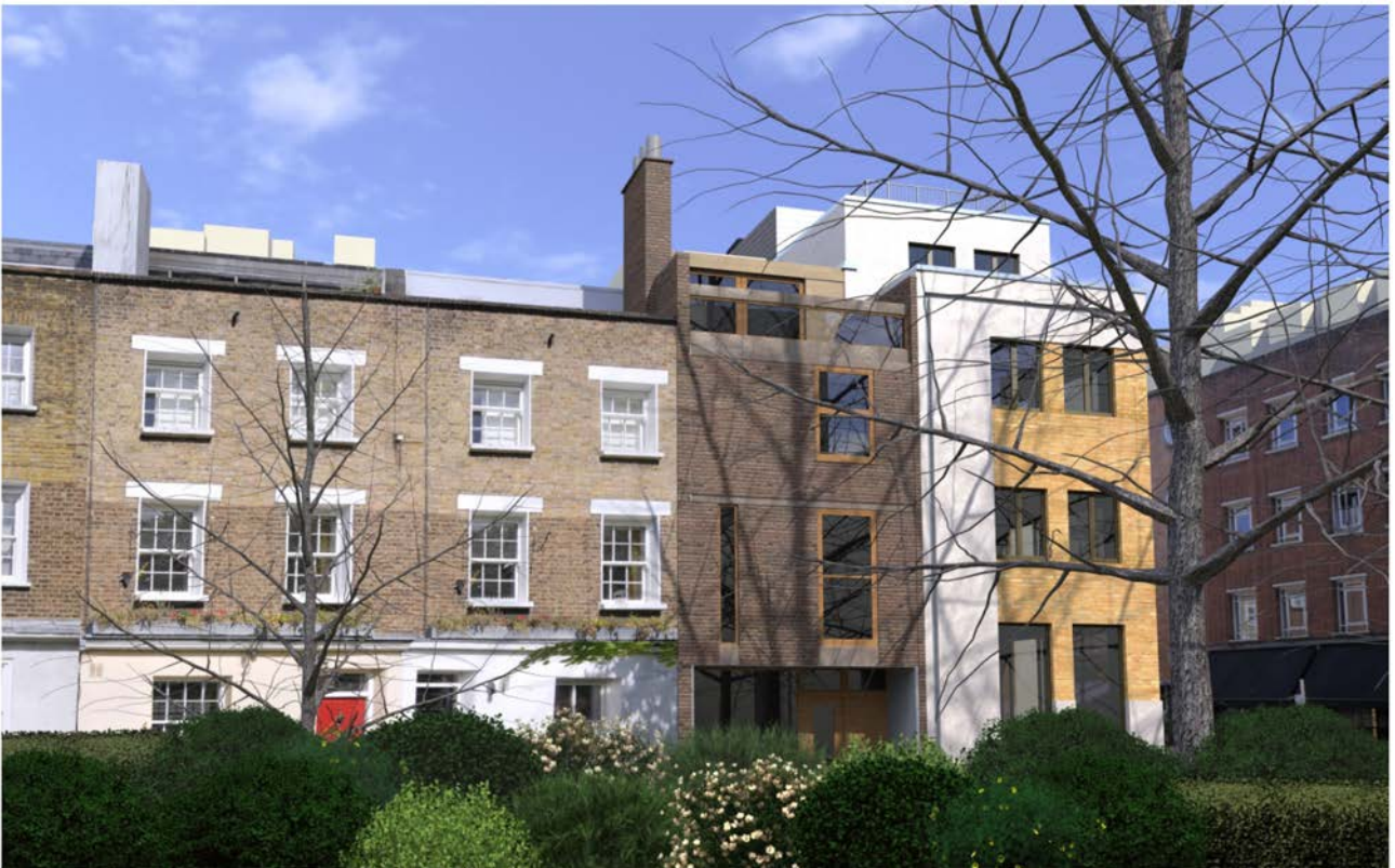
View 7 - View from Crabtree Fields: PROPOSED