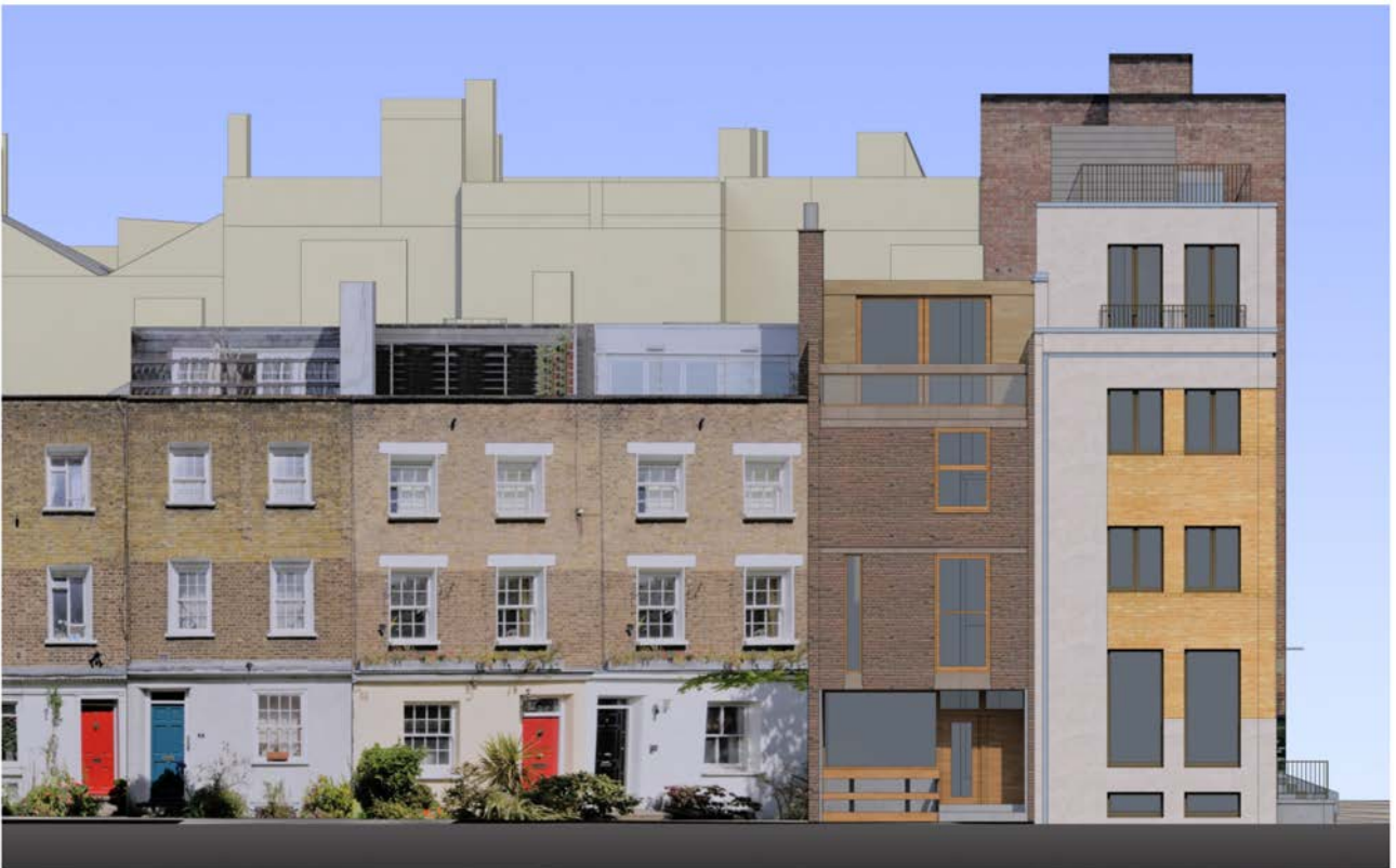
View1 - Elevation from Whitfield Street: PROPOSED