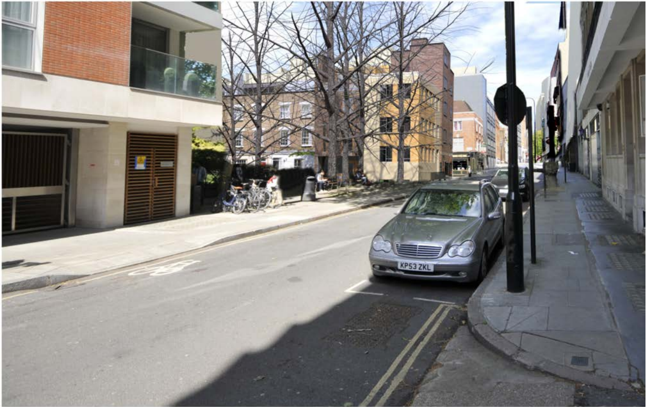
View 4 - View set back from Whitfield Street: EXISTING