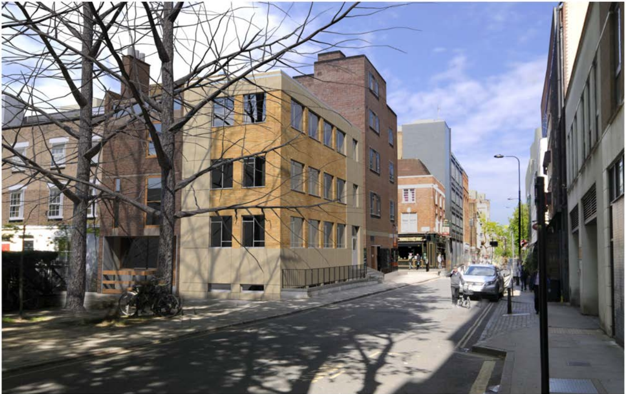
View 3 - View from Whitfield Street: EXISTING