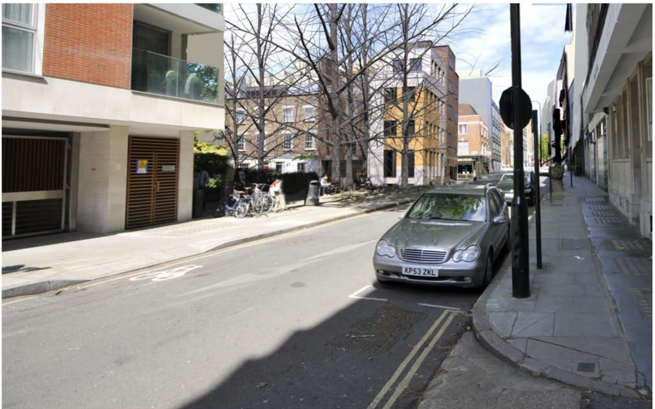
View 4 - View set back from Whitfield Street: PROPOSED