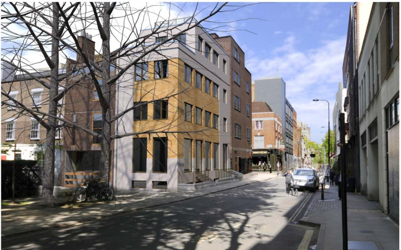
View3-View from Whitfield Street: PROPOSED