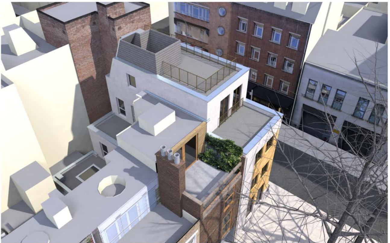
View5 - View from the air: PROPOSED