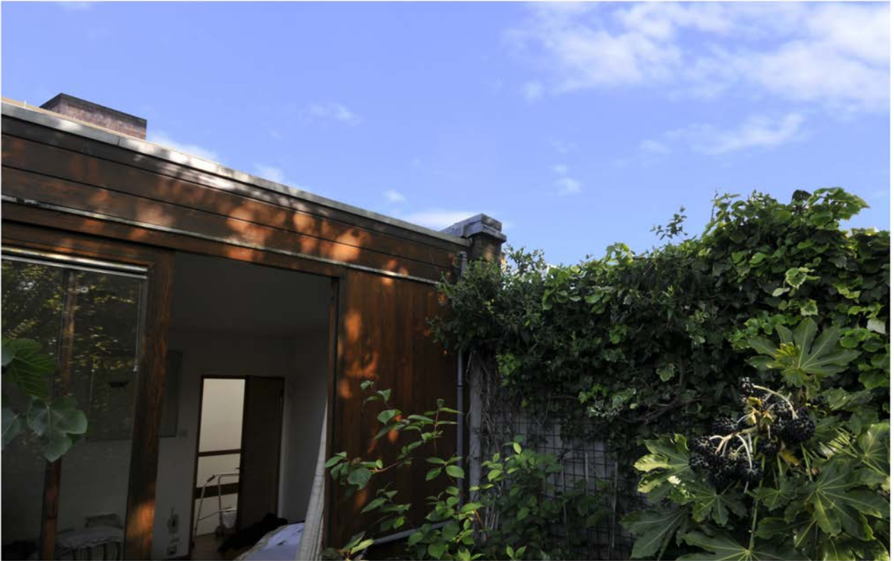
View 2 - View from 1 Colville Place Terrace Garden: EXISTING