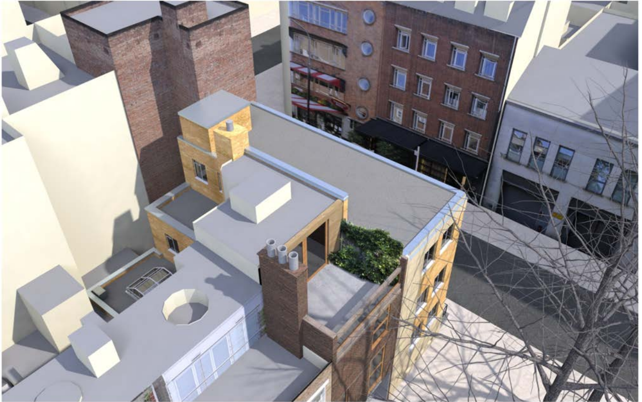
View 5 - View from the air: EXISTING