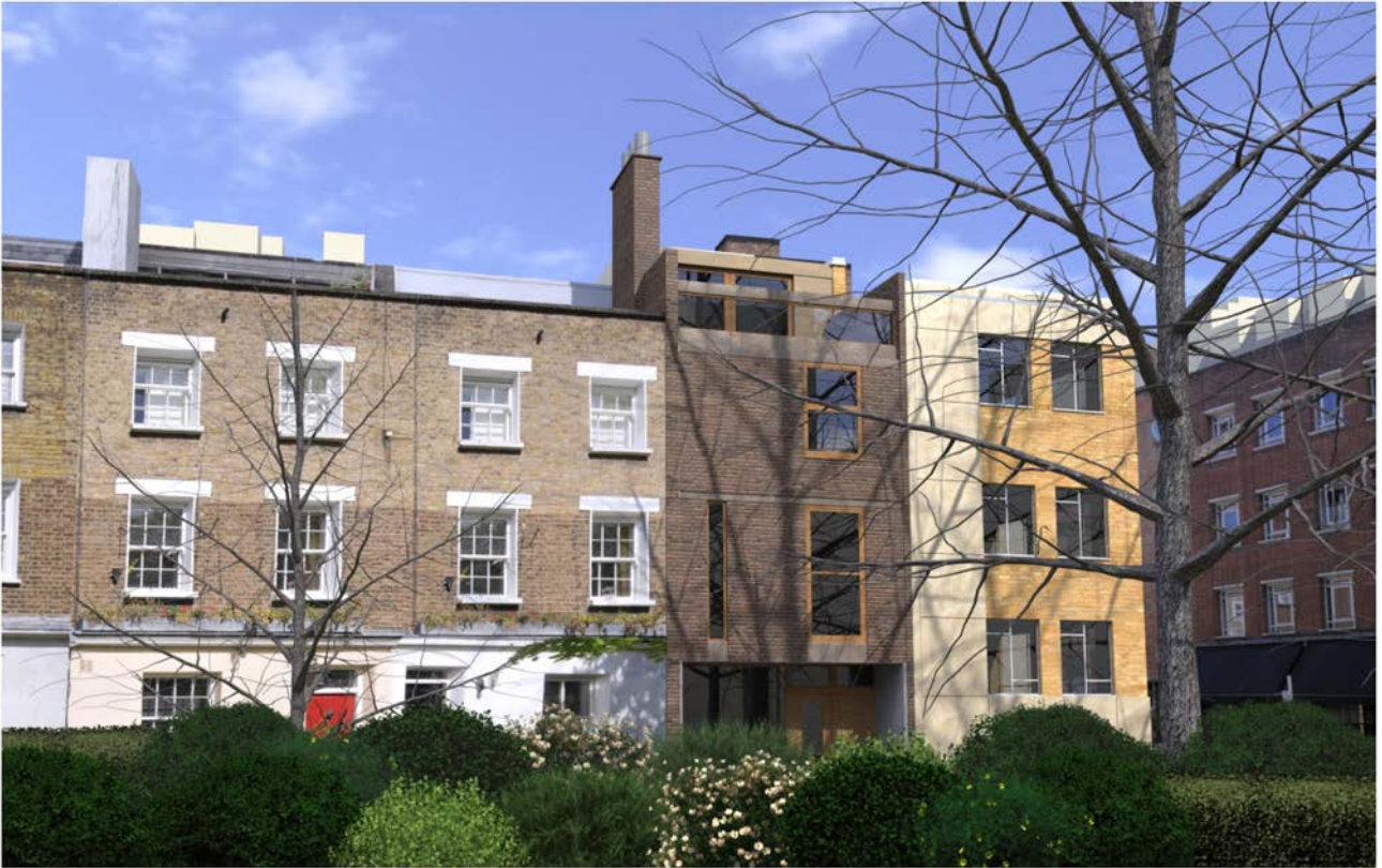
View 7 - View from Crabtree Fields: EXISTING