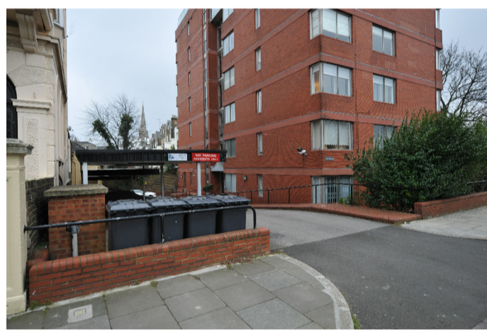
c Albert Terrace parking access