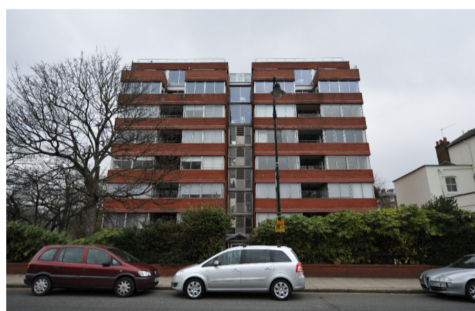
a Prince Albert Rd Facade