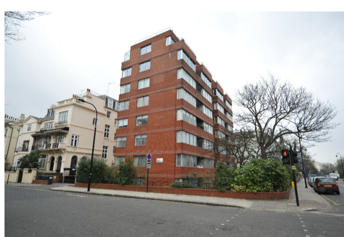
b View of the West Facade