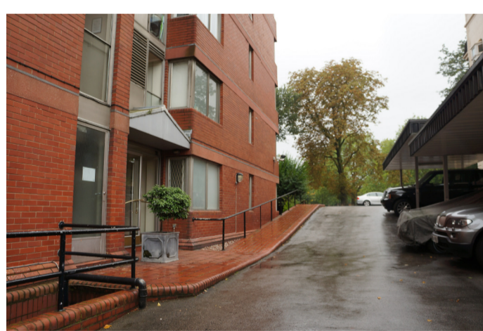
d View of the North Facade and Parking