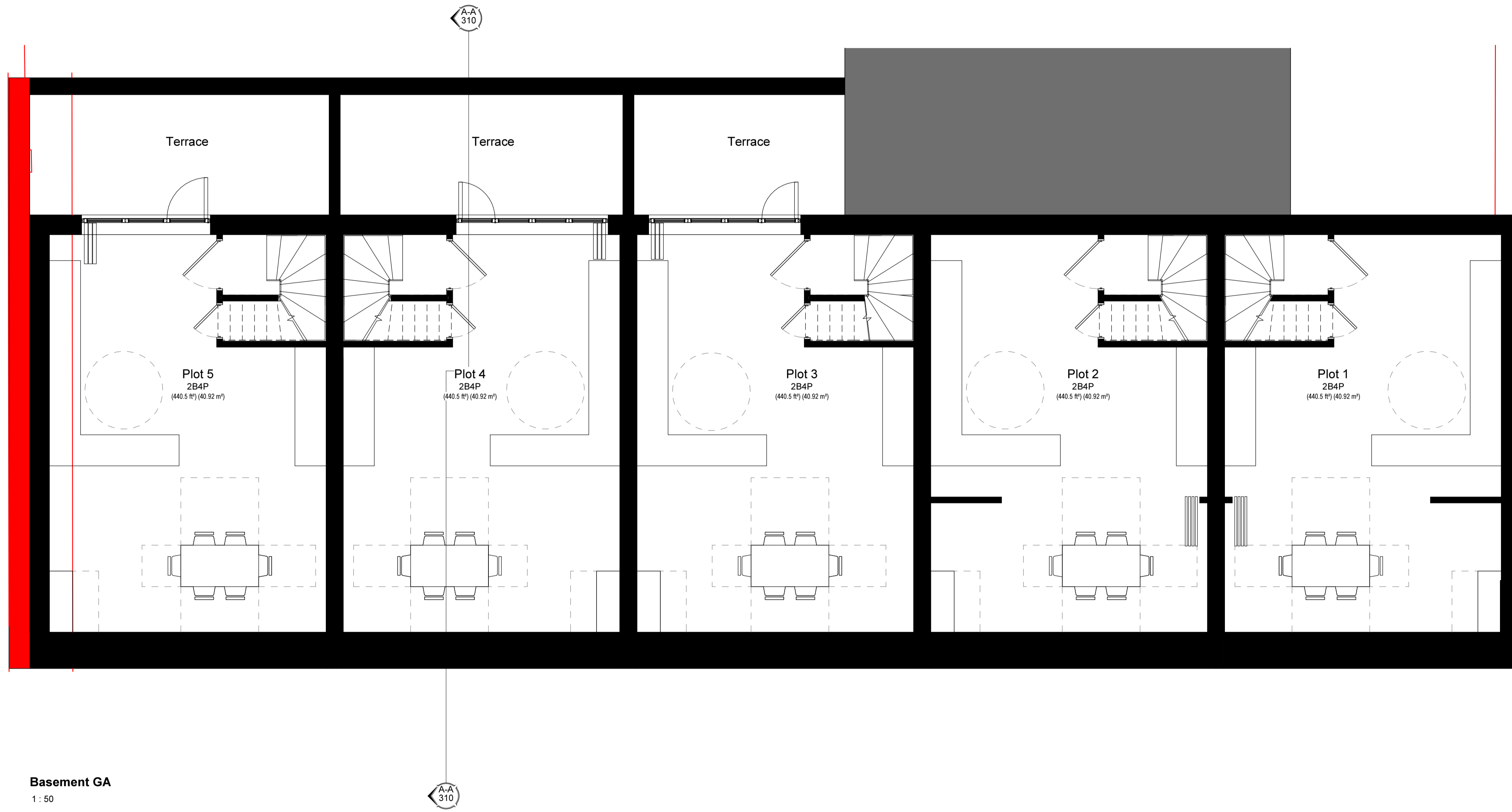
Basement GA 1:50

- For house type general arrangement refer to drgs. A(2)401, 402 & 403.