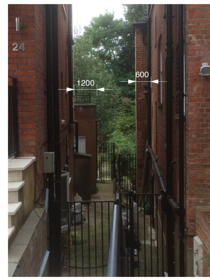
No .24 and 22 Hollycroft Avenue EACH WITH A SIDE PROJECTION TO REAR EXTENSION