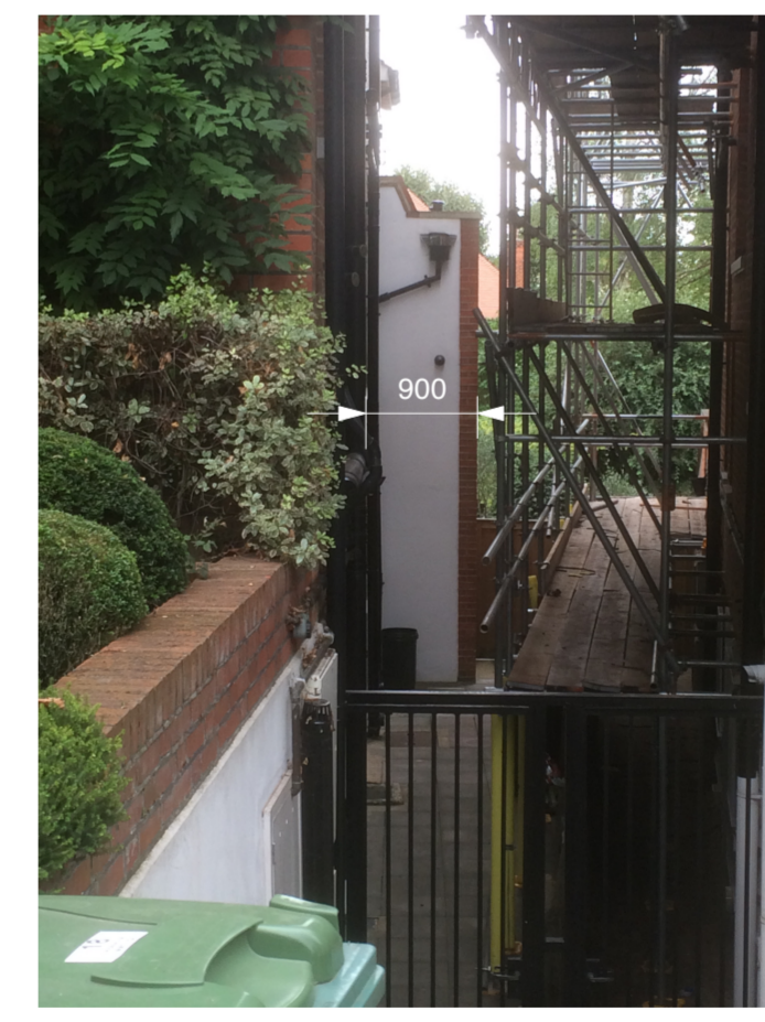
No .20 Hollycroft Avenue ALSO WITH A SIDE PROJECTION TO THE REAR EXTENSION

5d ARCHITECTS 764 FINCHLEY ROAD TEMPLE LONDON NW11 7TH LTD TELEPHONE 020 8458 4326 FAX NUMBER 020 8458 4322 MOBILE NUMBER 07721 498207 E-mail gsof@5darchitects.org.uk