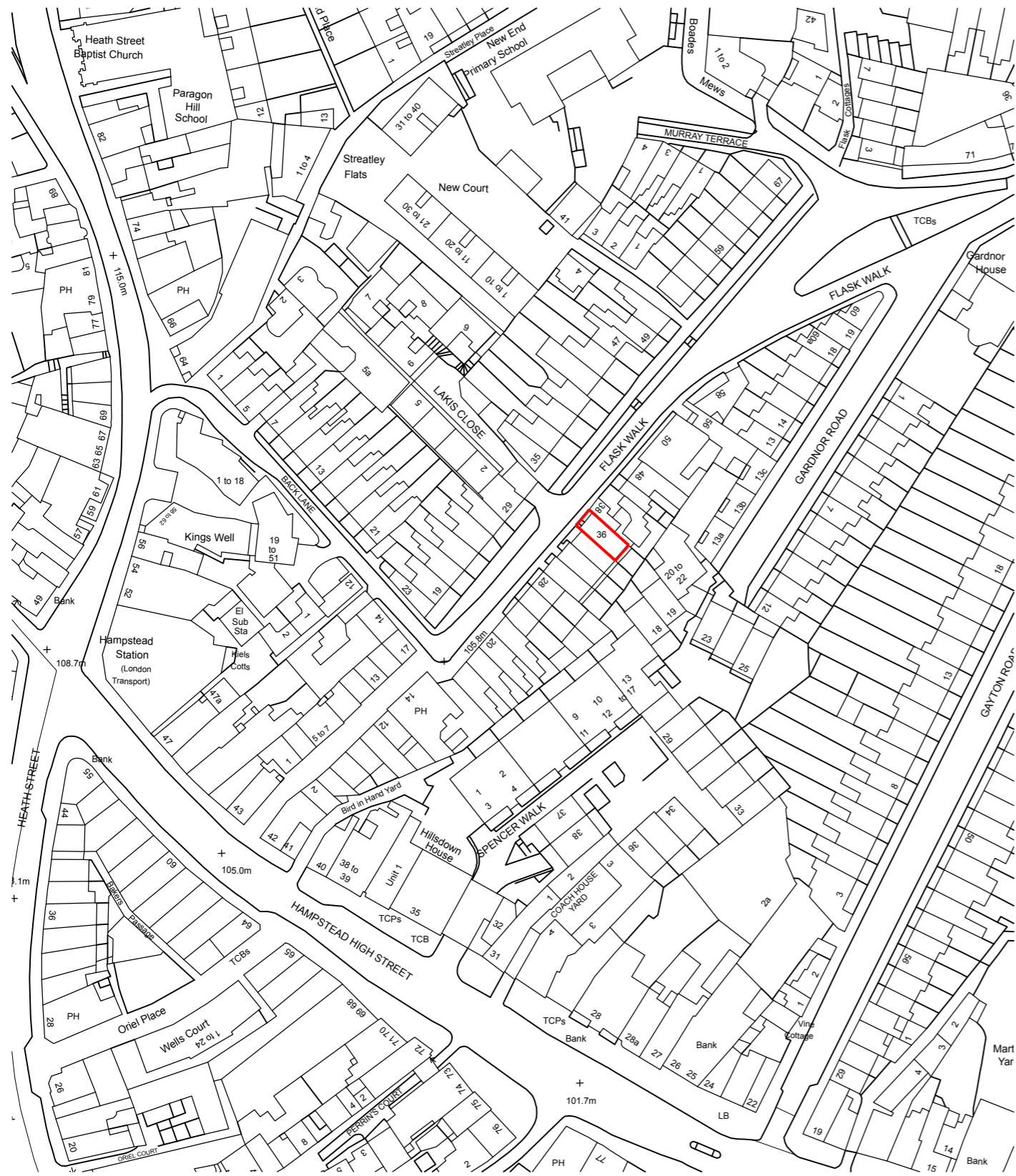
Location Plan 1:1250 @ A3