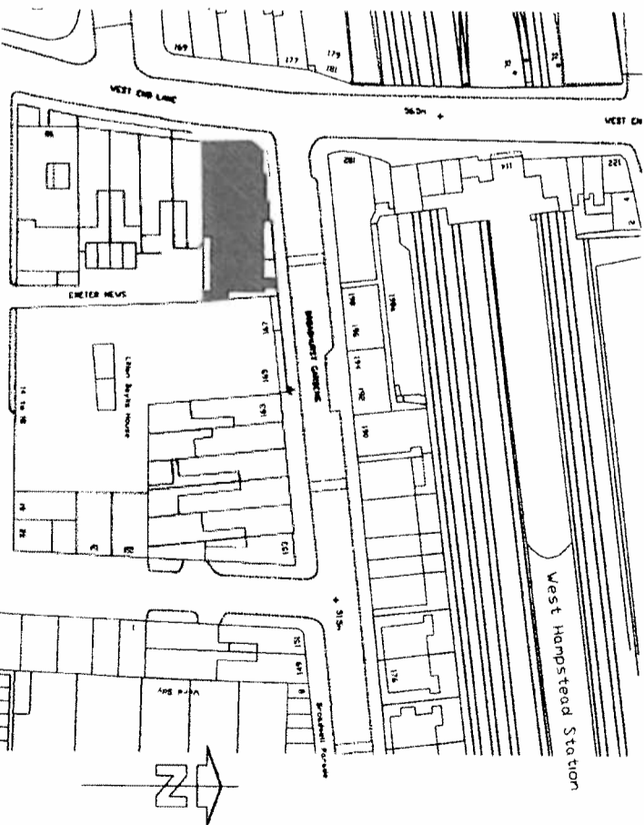
SITE LOCATION PLAN (SCALE 1:1250)