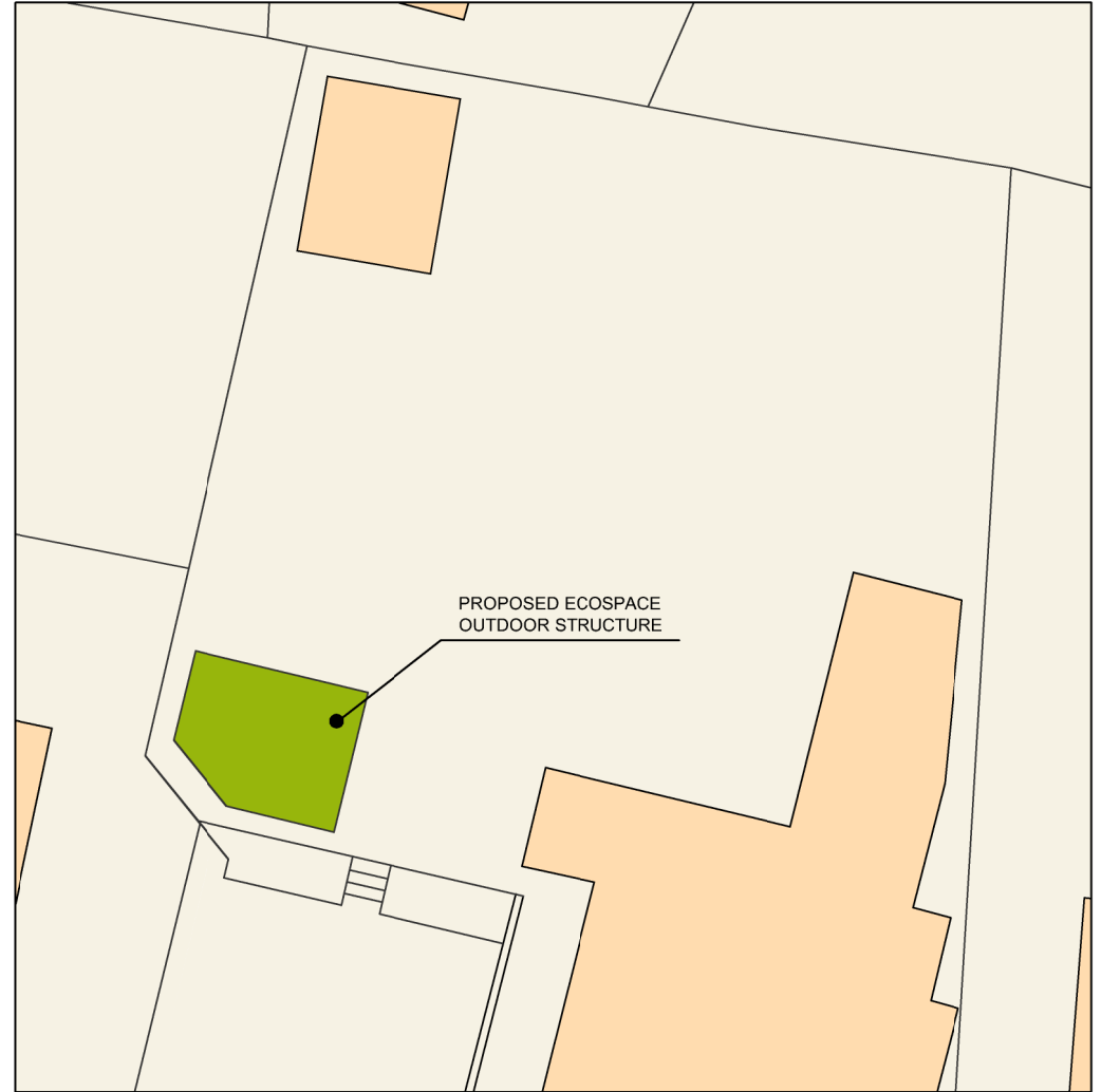
PROPOSED BLOCK PLAN SCALE 1:200