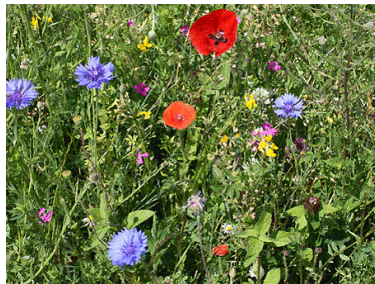
Wildflower green roof in planting season