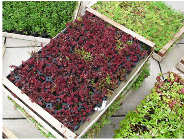
Plug plants as supplied to be planted onto roof

DO NOT SCALE DIMENSIONS OFF THIS DRAWING CHECK ALL DIMENSIONS ON SITE BEFORE FABRICATION REPORT ALL ERRORS OR OMISSIONS TO U-LA LIMITED THIS DRAWING IS PROTECTED UNDER COPYRIGHT AND SHALL NOT BE REPRODUCED IN PART OR WHOLE WITHOUT PRIOR EXPRESSED PERMISSION OF U-LA LIMITED