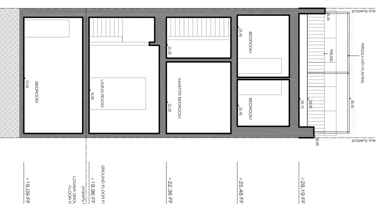
Existing Section B