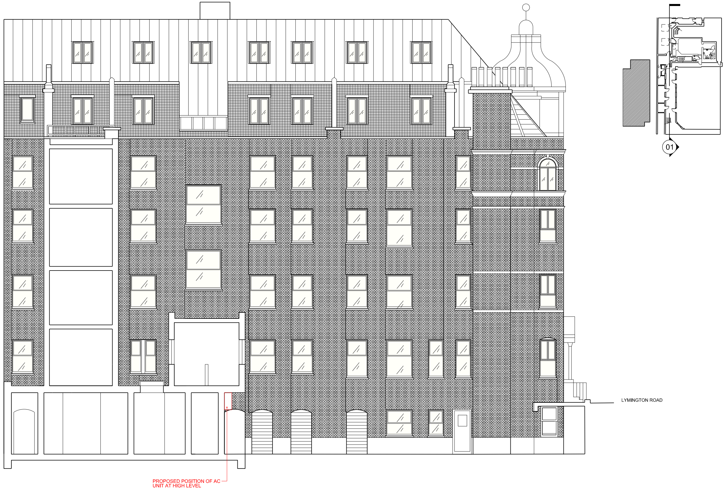
01 PROPOSED SECTION 1:100