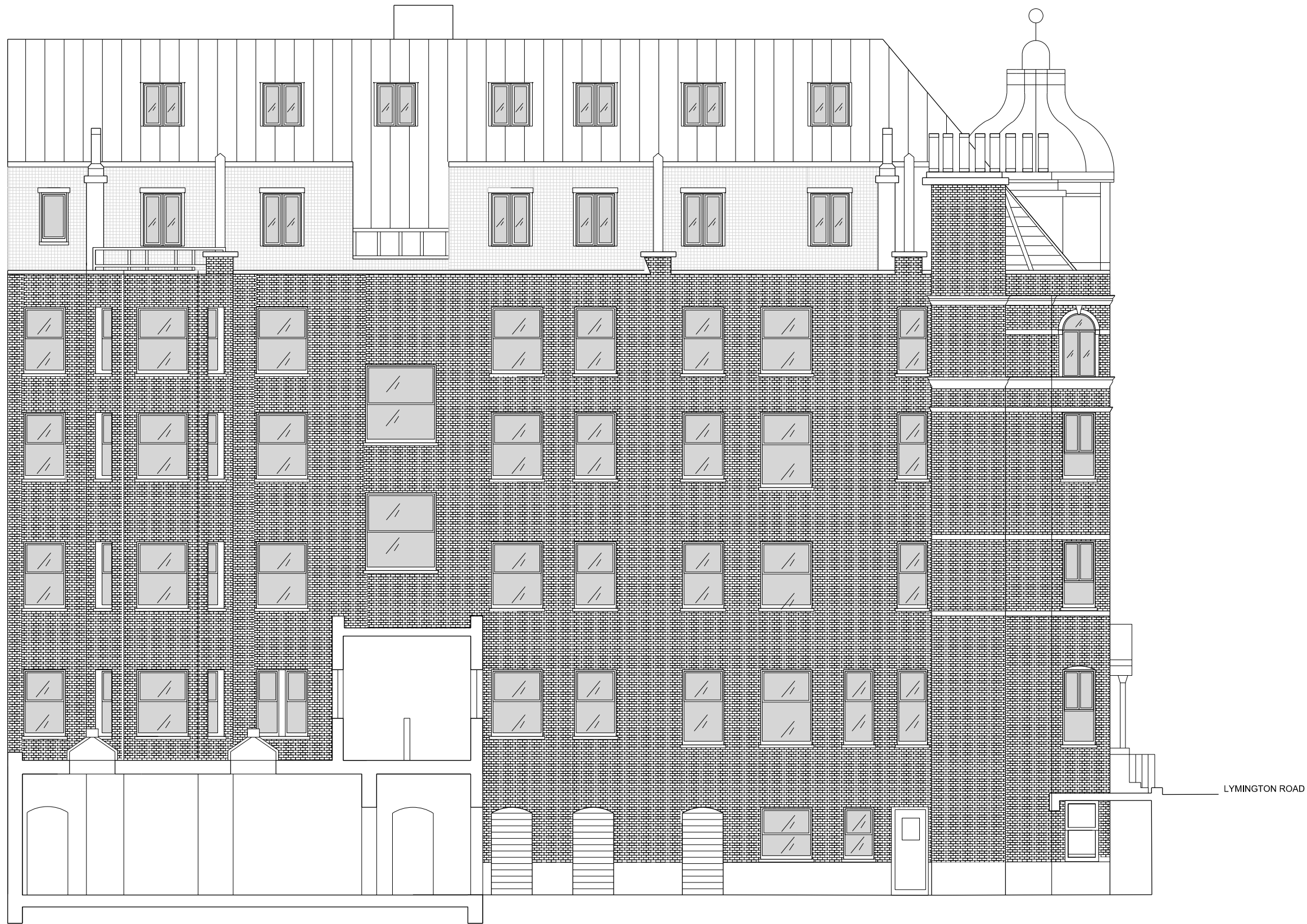
01 PROPOSED BACK ELEVATION 1:100