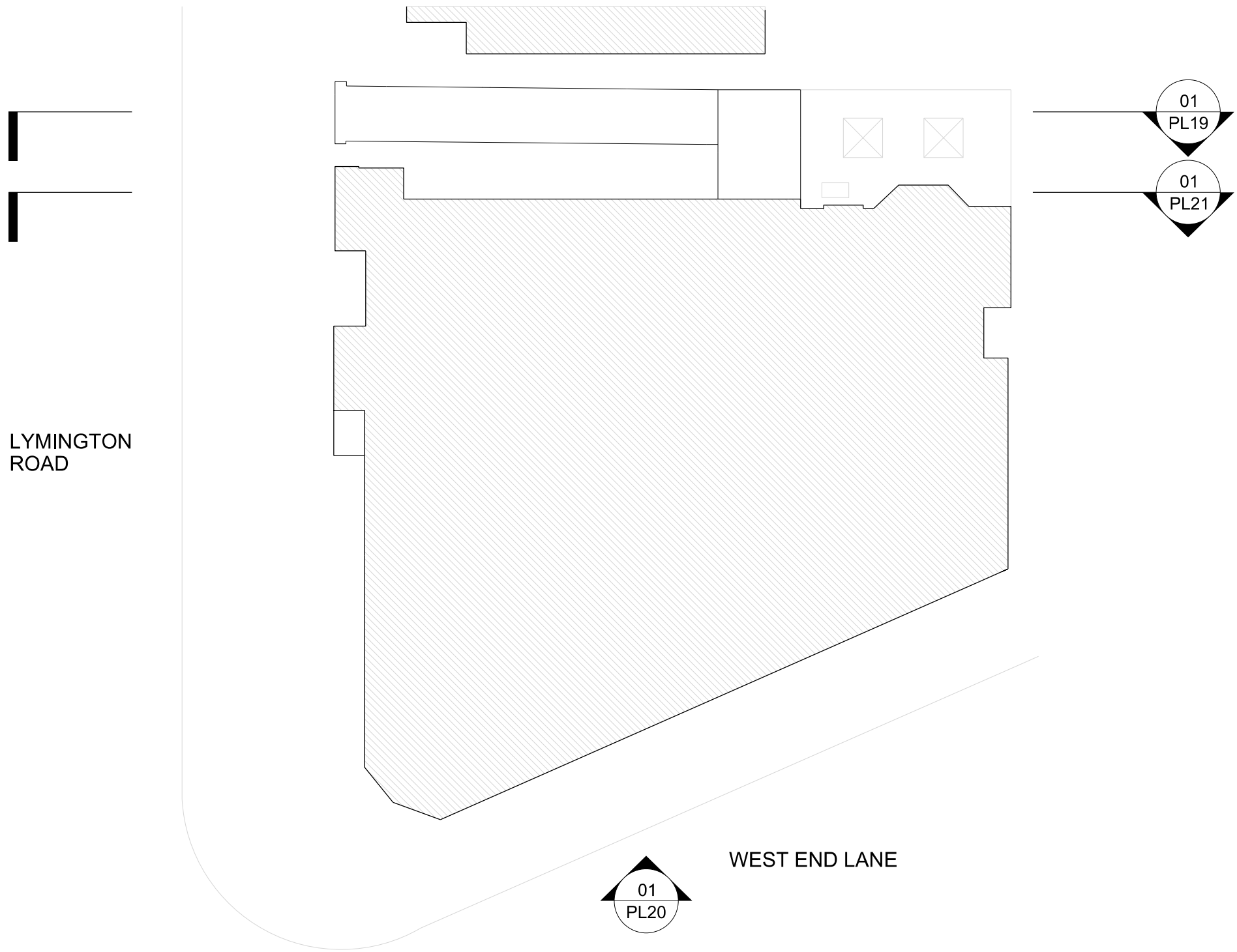
01 PROPOSED FIRST FLOOR GA 1:200