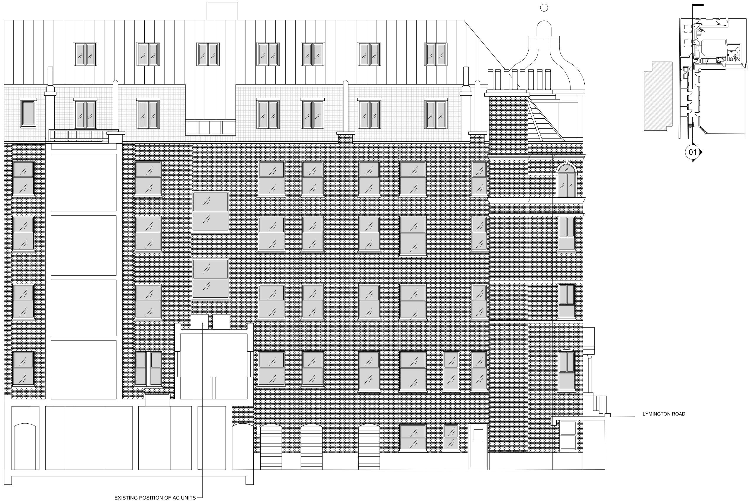
01 EXISTING SECTION 1:100