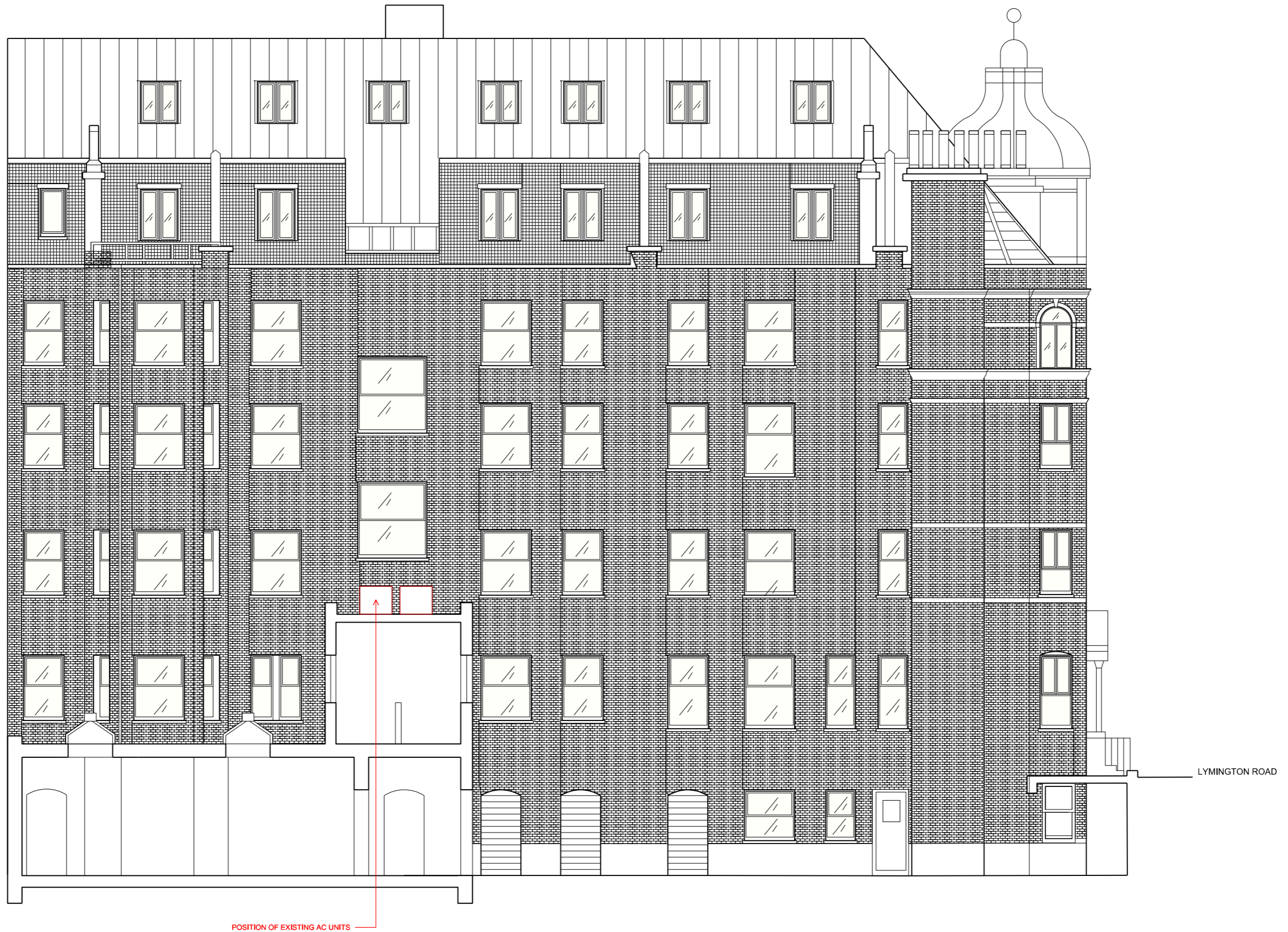
01 EXISTING BACK ELEVATION 1:100