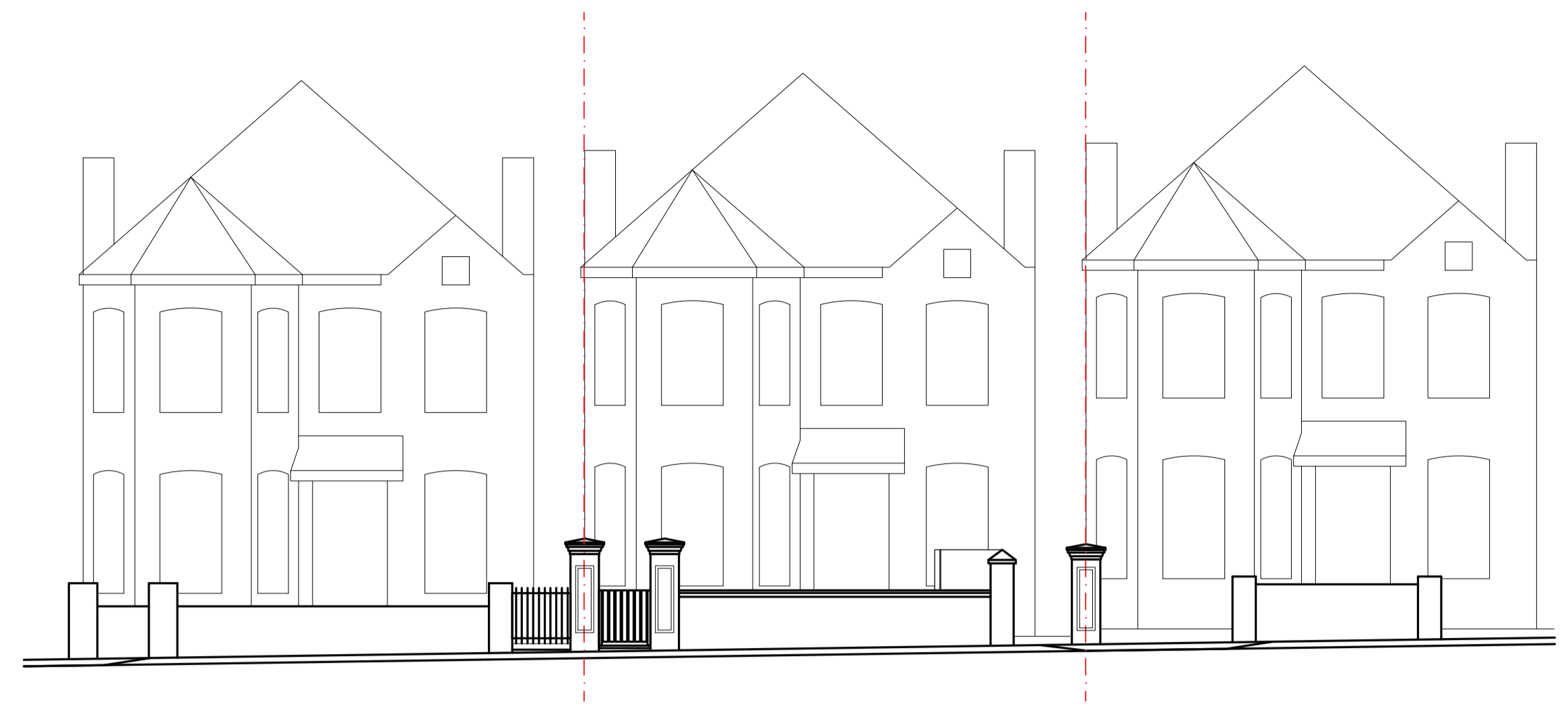
Existing Street Elevation at 1:100

Rev. Date Details Drawn Checked Issued for: