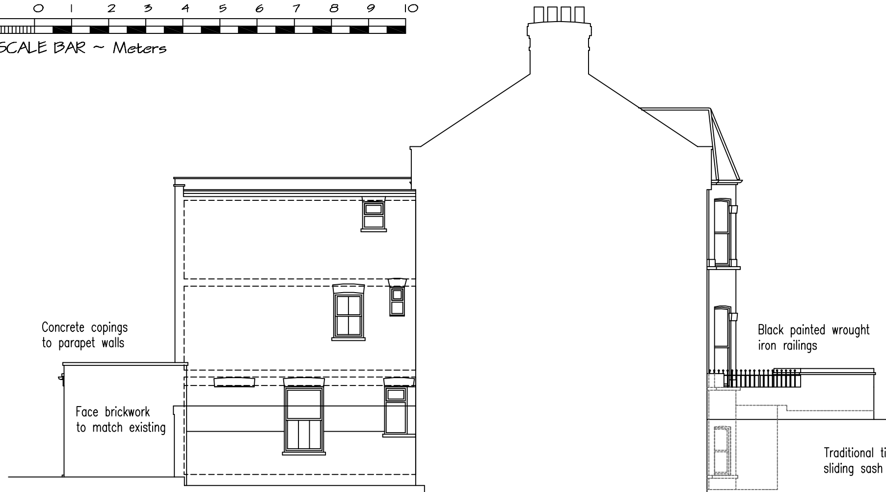
SIDE ELEVATION Viewed from No 26