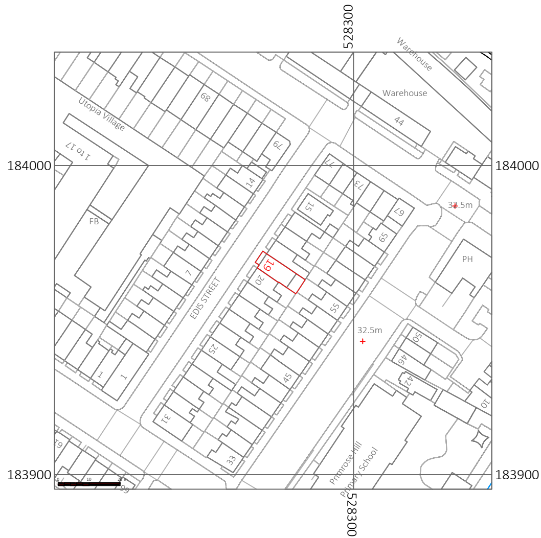
LOCATION PLAN SC 1:1250